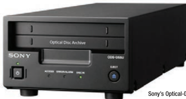
Sony's Optical-Disc Drive

Live operation is supported by AB Live complete stereoscopic systems, with direct fibre adapter link with standard metadata connections to the OCP Operating Control Panel. The system also features a software analyzer tool with automatic image correction capability, in real time.