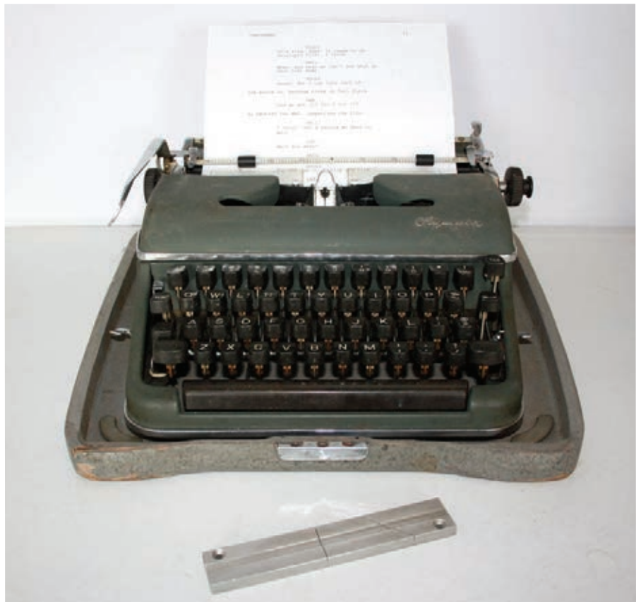
The typewriter and splicing block were well established linear editing tools in their day, in contrast to the nonlinear word processor and DAW of today.

Likewise, dialing a phone on a traditional land line is an online process. If you realize you've made a mistake, you have to abort—hang up—and begin again. Dialing a cell phone, on the other hand, is an offline process. You compose the number and, if you make a mistake, you go back a step and delete the wrong input—edit it out—and input the right number. When the entire