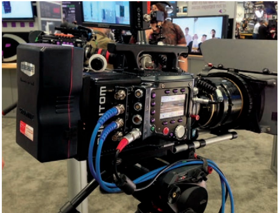
Blueshape's new battery system on a Phantom Flex4k digital cinema

The Air Fluid Head, composed of magnesium alloy housing and precision components, comes with two positions of selectable counterbalance and a dual pan handle option. Both systems can support payloads ranging from 5.5 pounds to 11 pounds, suitable for professional DSLR and HDV photo-videographers.