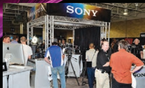
The Sony booth alone measures an incredible 2,000 sq. ft.