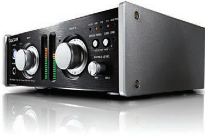
Tascam's UH-7000 4x4 Channel Microphone Pre-amp

Another crucial component of the UH-7000 is its audiophile-designed +48V phantom power supply and extra-large power transformer. Additionally, the mic pre/interface has a solid aluminum structure; meticulously calibrated knobs for smooth, custom-tapered gain setting and bright 20-segment LED peak meters to accurately convey each channel's true level. The device is also equipped with two XLR balanced inputs and outputs, two balanced 1/4-inch inputs, and an AES/EBU digital out.