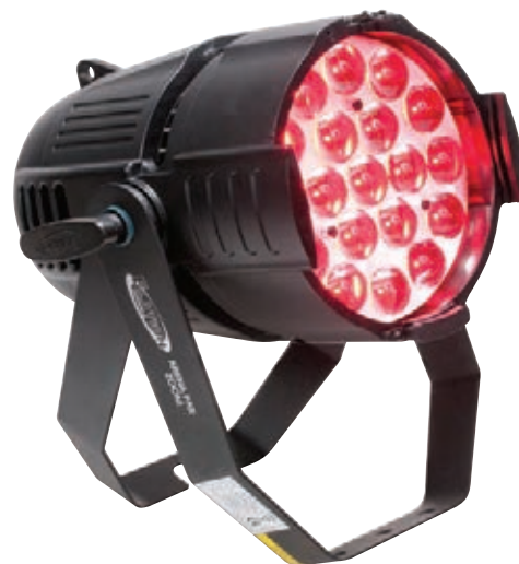
Arena's New PAR Zoom

The Arena PAR Zoom comes with a host of standard features like DMX control with 3-pin and 5-pin XLR