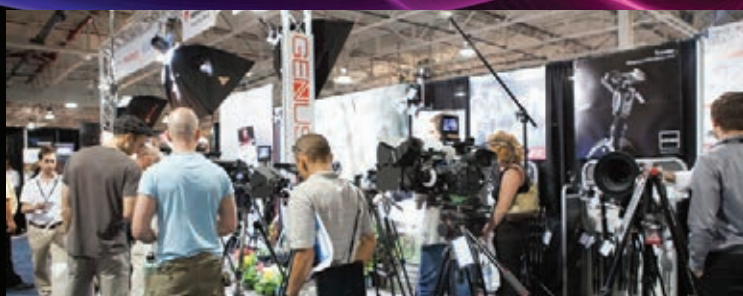
The ProFusion tradeshow floor spans a massive 70,000 sq. ft.