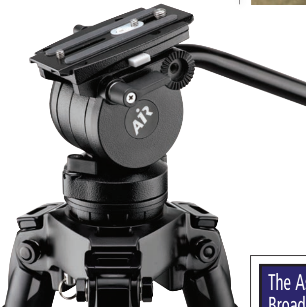
Complete systems for live 3D shooting from Thales Angénieux and Binocle 3D

The Air Carbon Fibre System features all the same benefits of the Air Alloy System but with less weight, the manufacturer described—it's 9.9 pounds versus the Air Alloy System's weight of 10.8 pounds.