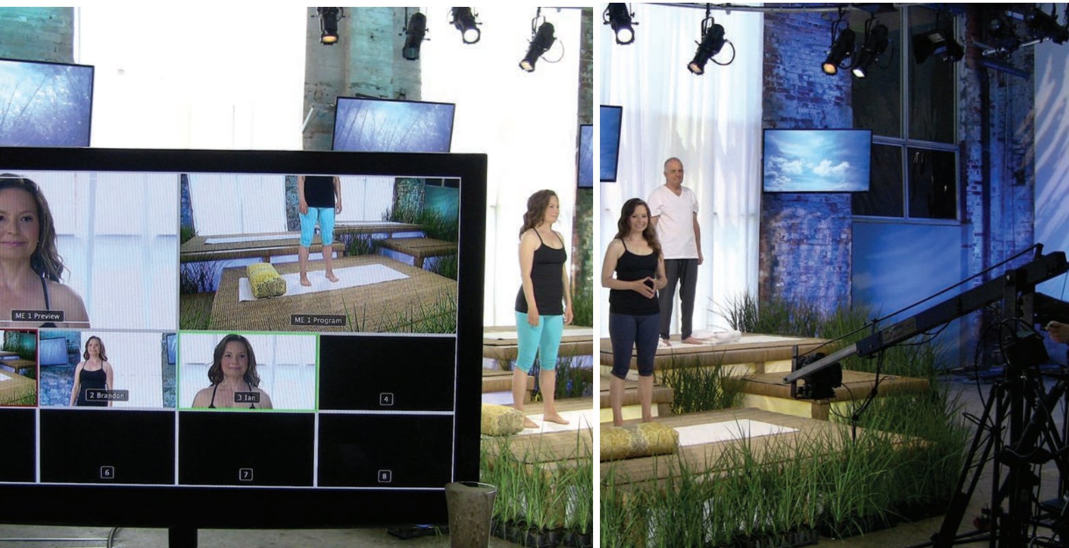
Healing Yoga: Yoga for Real People with Real Problems is produced in HD at the large Public Performance Space at the ZoomerPlex in downtown Toronto's historic Liberty Village.