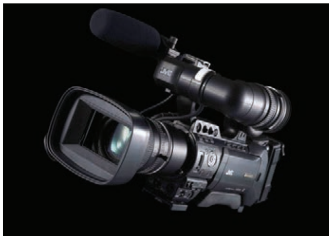
JVC's HM890 HD Camera with Built-in Streaming Codecs

Available as a physical server or cloud-based solution, ProHD Broadcaster receives live video from a GY-HM850, GY-HM890 or updated GY-HM650 3.0 camcorders, transcodes the signal for a variety of delivery platforms, and provides reliable transmission of the signal. A built-in matrix switcher with unlimited I/O makes it easy to manage signals for distribution,