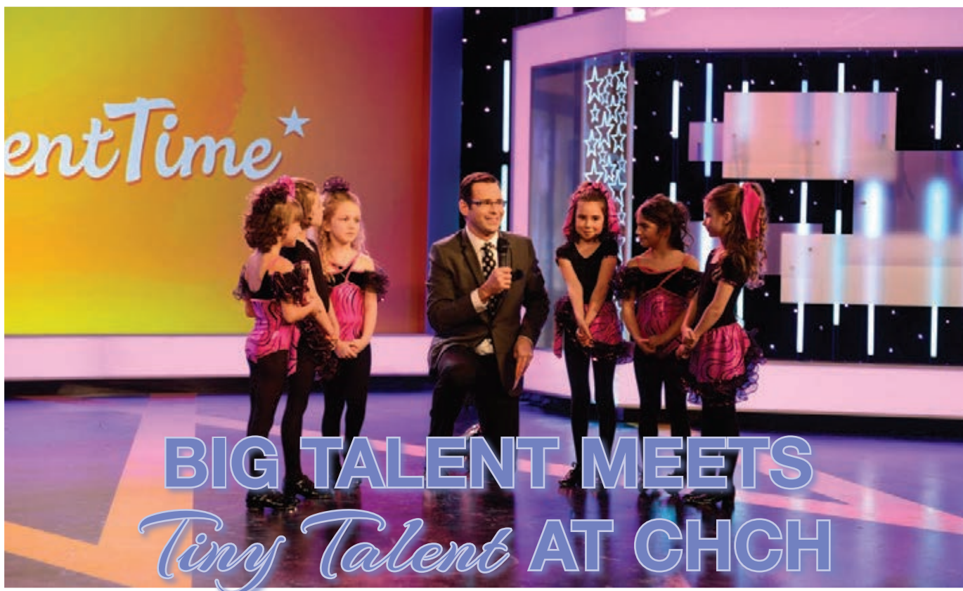
Channel Zero's CHCH-TV is bringing back Tiny Talent Time , and combining some TTT legends with young future stars, enthusiastic hosts and dedicated new production team.

One of the longest running and most-followed family shows in Canadian television history is back on air.