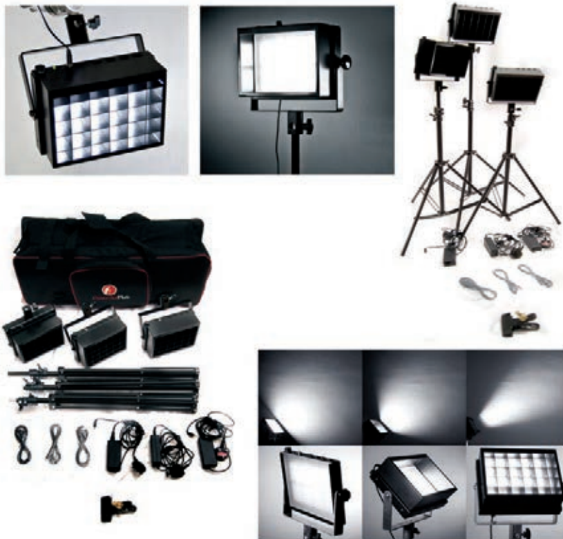
New Softy Lite LED Packages and Panels

The light is available as a single light set or a 3 or 4 light kit, each complete with stirrup, stand, diffuser, snoot and egg crate for each light. Mains power supplies are sold separately, along with other accessories.