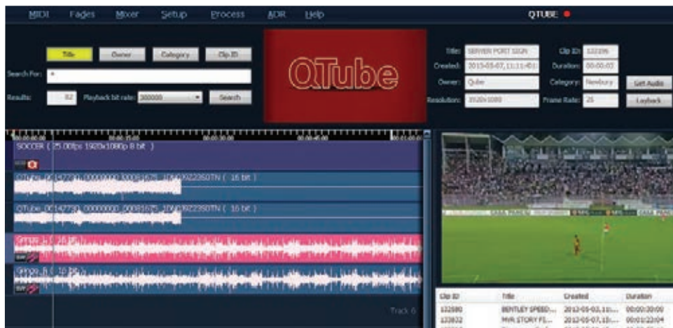
Fairlight Gateway with Quantel Integration

MSE's MINIVATOR II accessory package includes a Rocky Mountain leg and optional 4" casters.