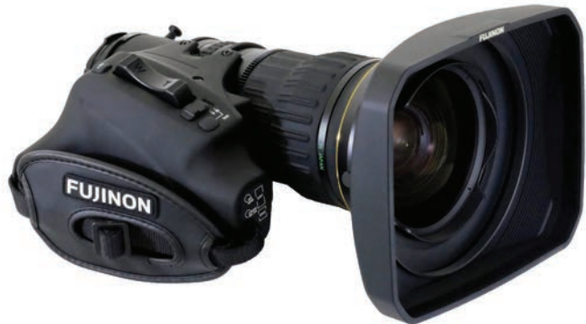
The HA18x5.5 HD zoom from Fujifilm's Optical Division

The lens also has built-in digital servo drive units for zooming and focusing. Its ergonomic design reduces the weight for camera operators working handheld. Equipped with a 16-bit encoders, which outputs focus and other lens data at high resolution, the lens is compatible with various systems such as a virtual studio programs and combining CG with live footage.