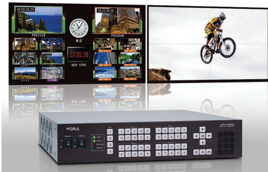
New 4K Multi-viewers from FOR-A

products, including the new LTR-200HS archive recorder that supports new LTO-6 tape technology and Avid DNX-HD. It features HD/SD-SDI input/output, broadcast quality codec, and MXF