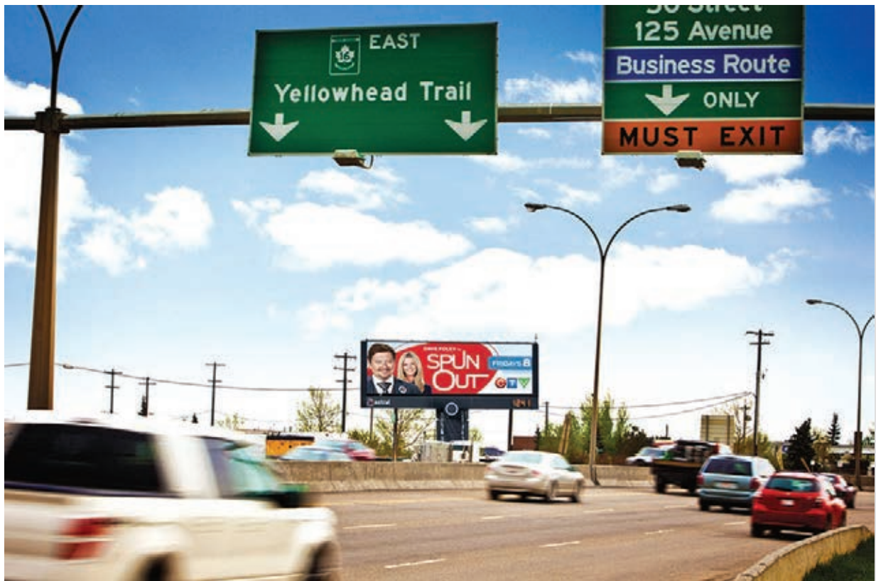
Broadcasters, media companies and ad agencies are making use of large format digital screen, such as those operated in Edmonton by Astral Out-of-Home.

Leading TV and media companies, ad agencies and content providers in Canada are building loyalty among their audiences and increasing their own revenue opportunities with new out-of-home digital signage systems and services.