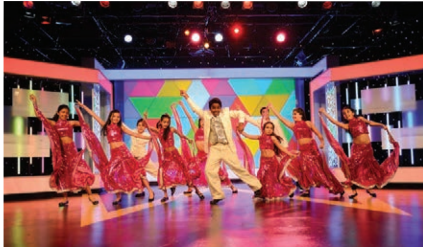
When CHCH put out a casting call for big talent in tiny packages; an overwhelming response was received from parents, individual performers and large ensembles.