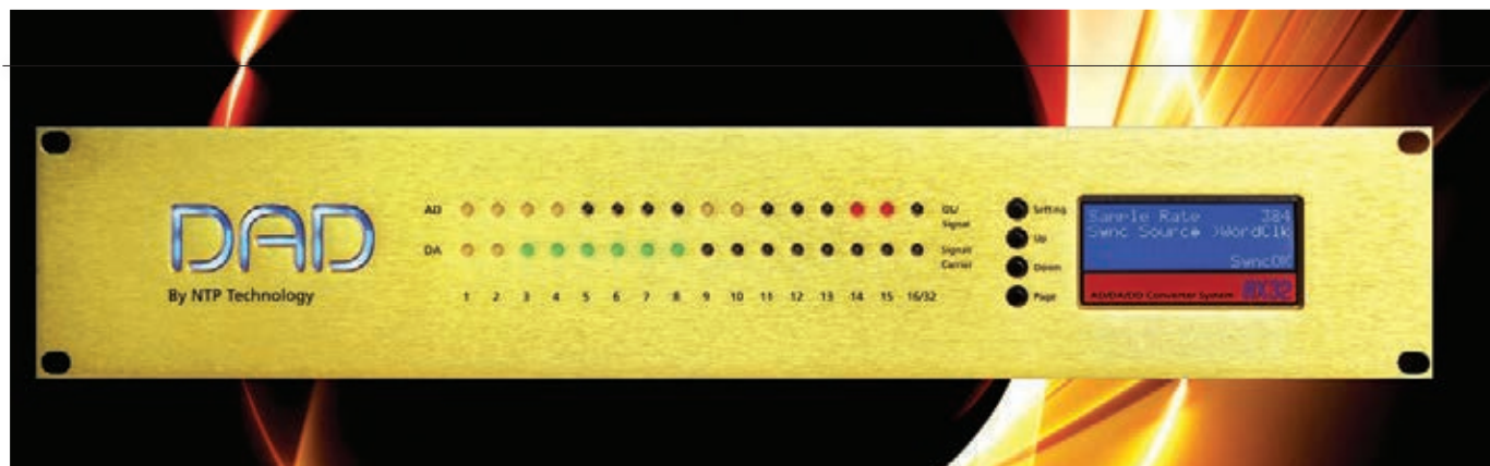
EUCON High-Speed Ethernet Protocol for Post Audio