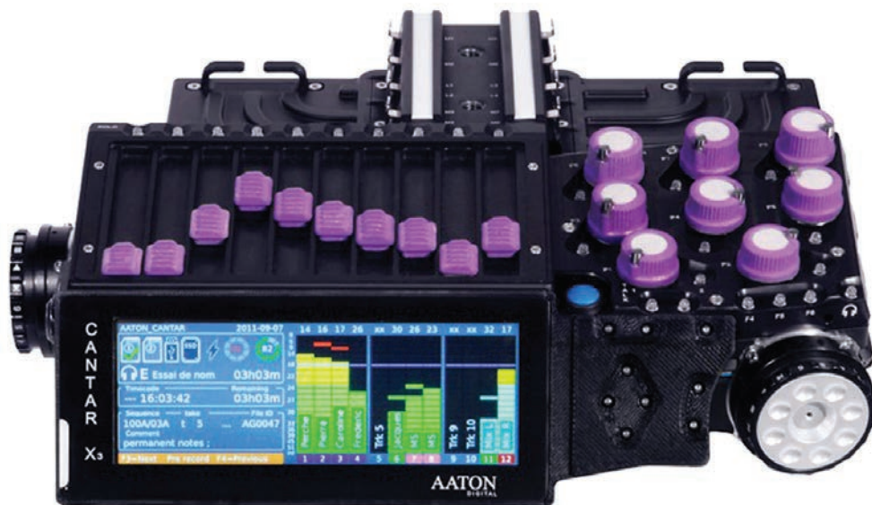
Aaton-Digital's Cantar-X3 recorder

Extended linear faders, smooth rotary knobs and silent switches are provided, and additional features can be accessed through an improved interface with new display based menu control, developed by sister company Transvideo. The bright colour front panel display swivels for greater visibility.