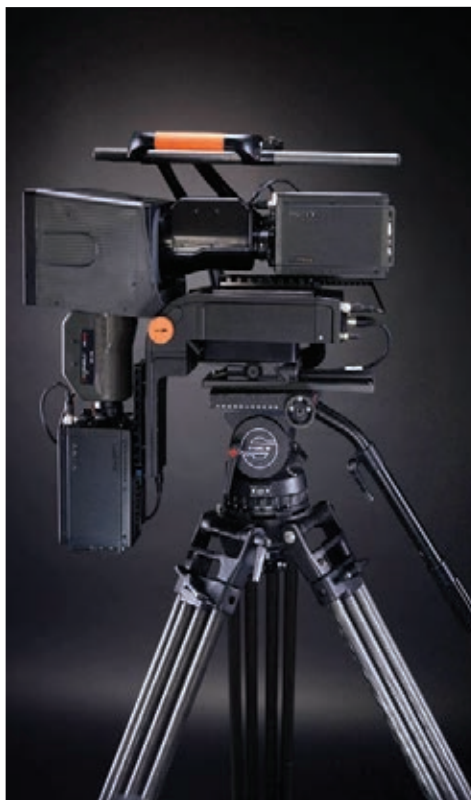
Complete systems for live 3D shooting from Thales Angénieux and Binocle 3D