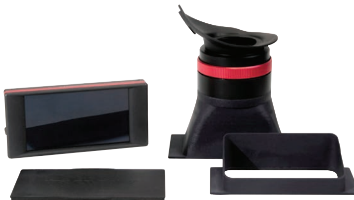
Transvideo StarliteHD monitor accessories

The Sony Optical Disc Archive system can be used for very long term archiving, such as broadcaster archives where data tape does not provide the assurance or meet the need for write-once, very long-term archive requirements, and it can be used for news and sports clips that need to be near on-line and as an on-line browse and proxy clip store.