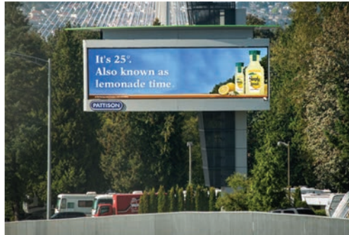
Control over interactive advertising content and creative is available on screens such as those connected to digital signage networks operated by Pattison Outdoor.

Pictures and video files are available in a wide range of news topics, as well.