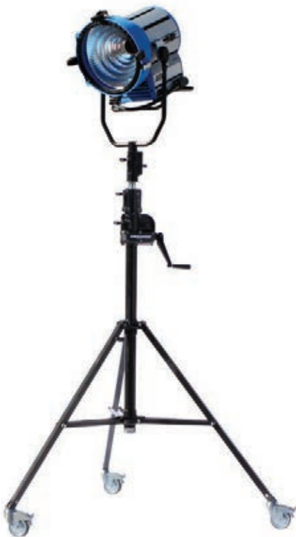
Increased Payload with New Minivator Light Stands

It reaches a maximum height of 142" (361cm), a load height of 55" (140cm), with a maximum load of 80 lbs (36.4Kg), weights 48 lbs (21.8Kg) and covers a footprint of 58" (150cm), the manufacturer reports.