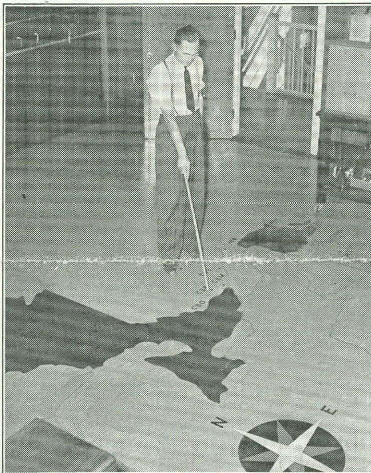
The floor of the main control room at Station CBK, Watrous, CBC's 50,000-watt Prairie Region Transmitter, is covered with a huge linoleum map of Canada, on which the locations of all CBC stations are indicated. Here a member of the operating staff is pointing out CBO, Ottawa. The map is subject to revision as new CBC stations are built.