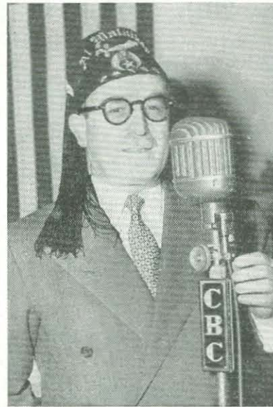
HAROLD LLOYD, well-known movie star and Imperial Potentate of the Shriners of North America, who was in Winnipeg recently for the formal dedication of the new Shriners' Hospital for Crippled Children. The ceremony was broadcast on CBW.

Last week the spotlight was on Robin Hood. The ballad to be sung and dramatized in the program this week will be about another great outlaw, famous because he robbed the