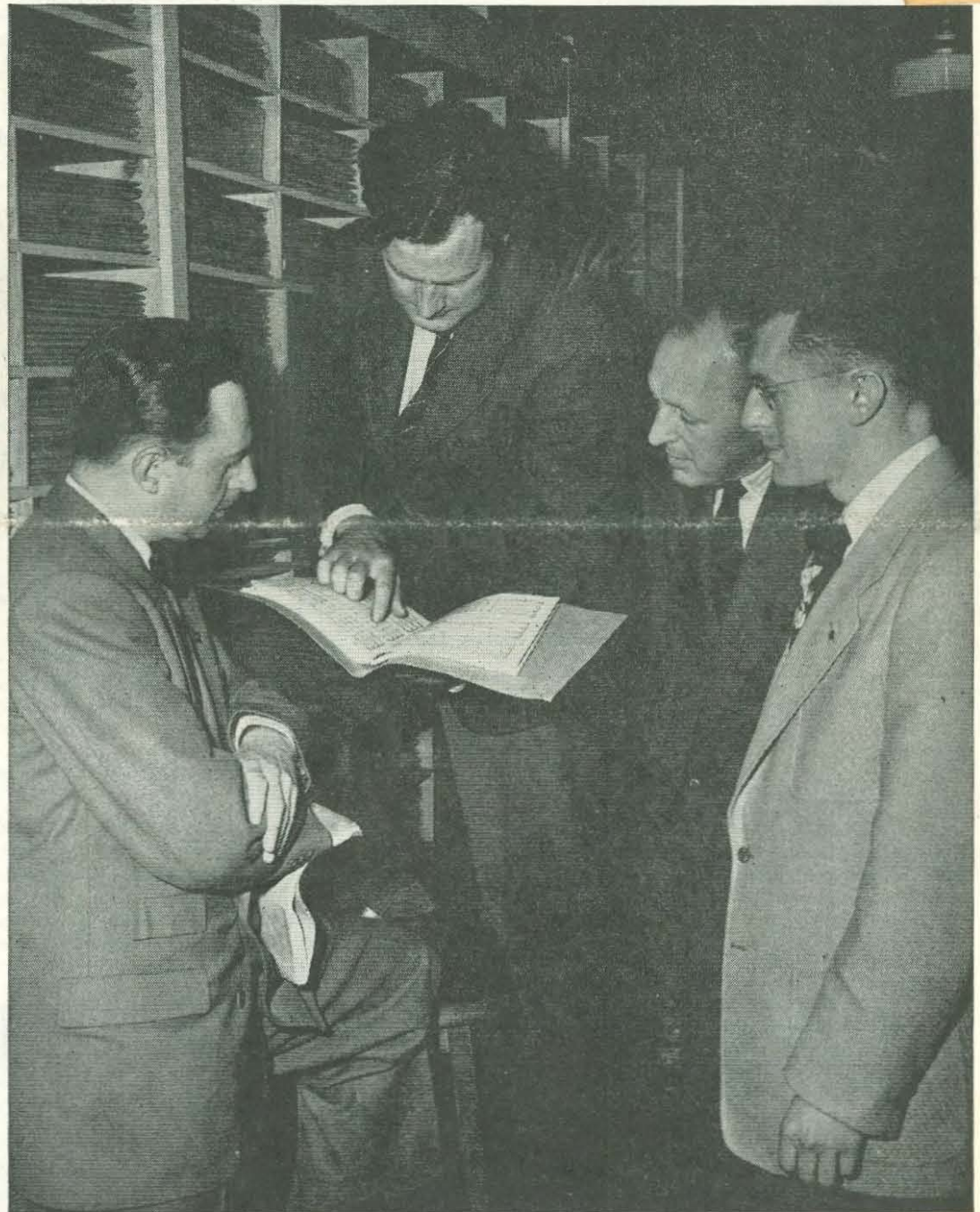
Startime At Vancouver

The Stage 51 plays are to be presented for the most part in blocks. There will be a series of