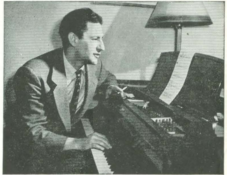
GIAN-CARLO MENOTTI, whose comic opera The Old Maid and the Thief will be heard on CBC Wednesday Night, August 9, from Vancouver. Commissioned by the National Broadcasting Company the work was written expressly for radio and was first performed in April, 1939. At present the composer is working on an opera for television.