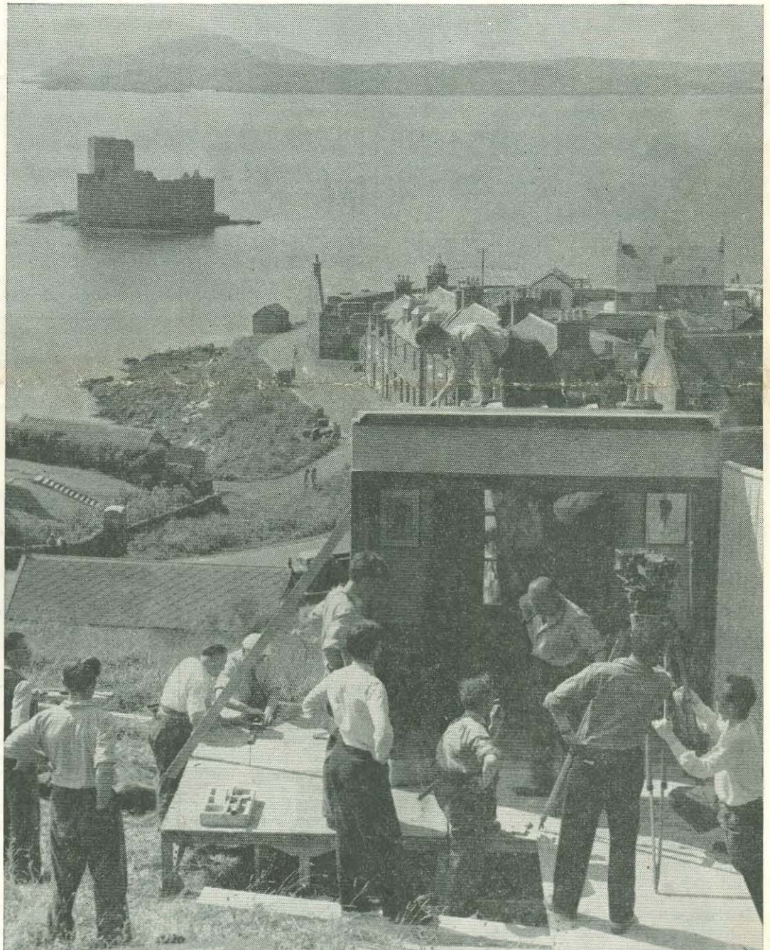
An English Film Crew "On Location"