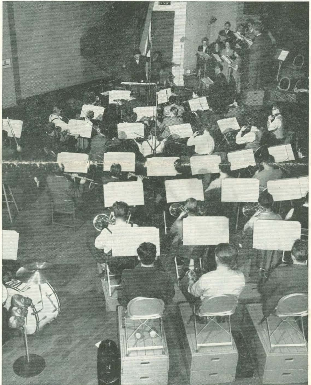
For A Big Show—A Big Team

Canadian composers and performers were anxious to make the most of the opportunity offered them after the war to establish reputations for themselves in Europe. Probably the most salutary development since the war has been the greatly increased direct contact of Canadian musicians with foreign audiences. It is possible that this relationship may be helped in the future by such fellowships as those provided by the Canadian Council for Reconstruction through UNESCO. Great credit is due to musicians such as Sir Ernest MacMillan, Raoul Jobin, Alexander Brott and Eugene Kash, who have spent much of their time during the last few years visiting foreign lands to perform and conduct programs of Canadian music. . . .