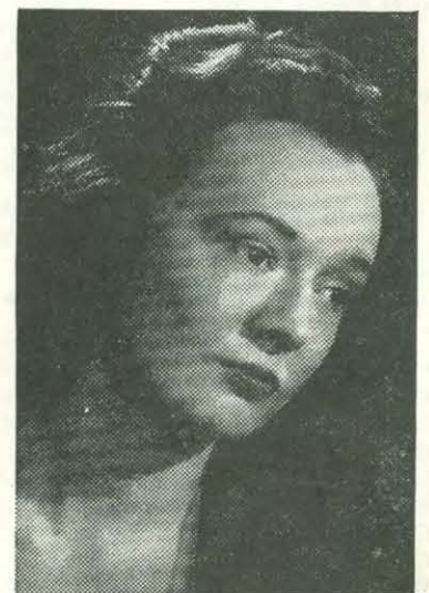
LOIS MARSHALL, Toronto-born soprano whose voice has brought her perhaps more awards than any other Canadian singer of her age, will make another appearance with the Toronto Symphony Orchestra this Tuesday (November 21).