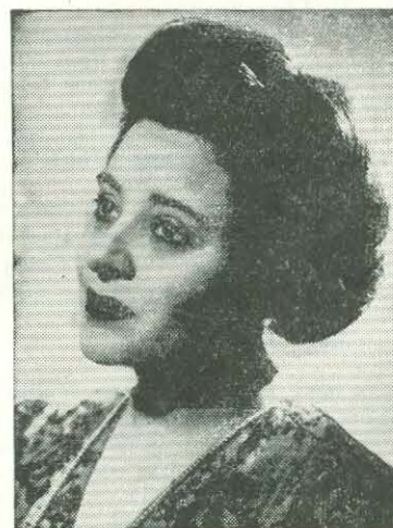
Victoria de Los Angeles

and Handel; Weber, Schumann and Brahms; and de Falla. Transcription supplied by the BBC.