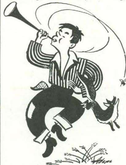
The Enchanted Fox

magic one; the fox is a beautiful princess, really, and the wasp is a black magician. All very confusing,