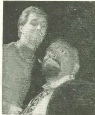
Iago and Othello

Othello is generally regarded as of all Shakespeare's great plays, the one most nearly conforming to the "classical unities." It is close-knit and cleverly constructed, though less rich in poetry than the other great tragedies — Macbeth, Lear, Hamlet and Antony and Cleopatra —produced in his period of "dark vision," from 1600 to 1608. Lear, Macbeth , and Antony are drawn against the broad tapestry of nations in conflict; Hamlet and Othello are more personal, with circumstances, leading inevitably to