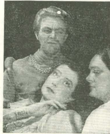
Iago, Desdemona and Emilia

tragedy, created by a few. Chance is an element in both plays. Hamlet's ship is attacked by pirates, and he returns to Denmark; Desdemona drops