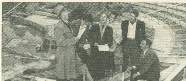
The Stratford Festival. The picture shows the uncompleted outdoor theatre and some of the performers who will be heard during the Festival.

T HE CBC has released audience rating figures showing that more than 2,000,000 Canadians saw the CBC's television coverage of the Coronation. Viewers in Toronto and Montreal went almost solidly for the CBC's coverage of the historic event. During the afternoon CBLT in Toronto and CBFT in Montreal had an average total audience of 1,500,000. As the evening wore on, more and more sets were tuned to these two stations until the total number of viewers passed the 2,000,000 mark. The figures were based on an average of six people watching the sets in more than 300,000 homes in the CBLT and CBFT areas. The total CBC network TV audience for all of Canada would have to include about 8,000 television homes within range of CBOT in Ottawa and the thousands who viewed the Coronation on sets placed in more than 100 schools in the Ottawa and Hull areas. No estimate is available of the many millions who saw the Canadian production in the U.S., where the NBC and ABC networks carried the first two hours of the CBC's telecast. The figures don't take into account the many thousands of Canadians who watched repeat telecasts of highlights from the original Coronation program.