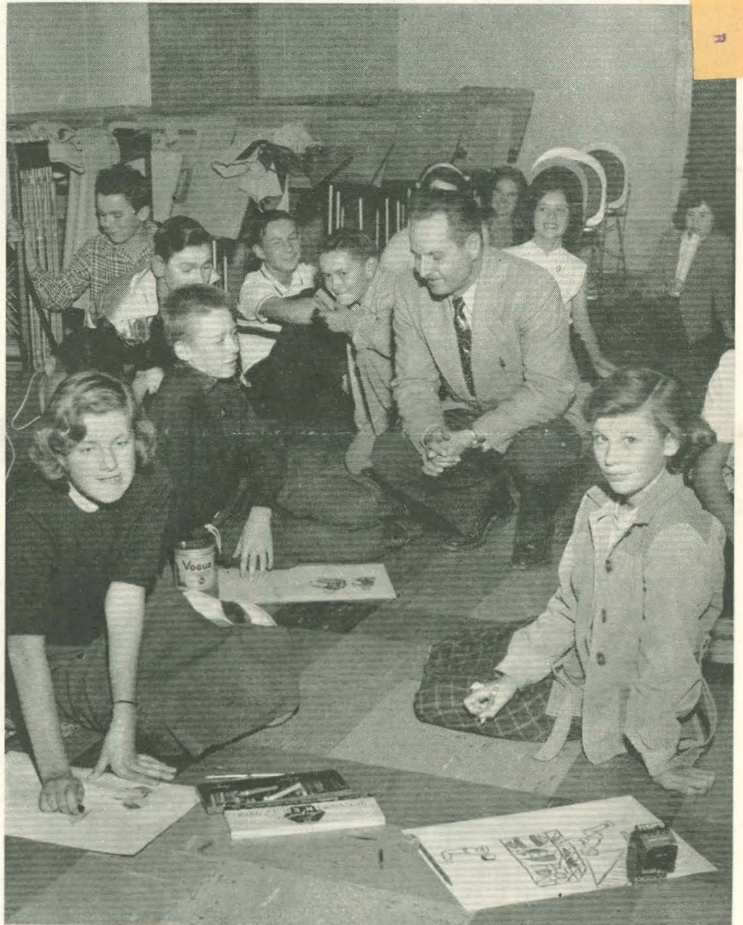
It's Fun To Draw