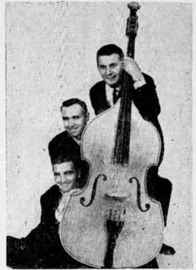
The Shamrocks, popular Edmonton trio, are seen Friday on CBXT's new series, "First Nighter."