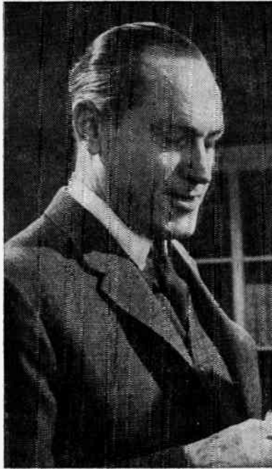
E. G. Marshall plays a defence attorney with a strong desire to do what is right, on The Defenders Thursdays.