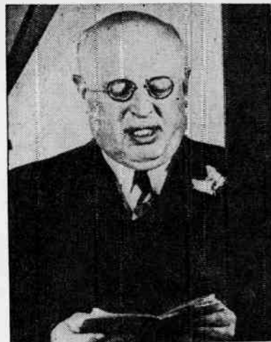
Controversial Alberta premier William Aberhart is the subject of a personality sketch Wednesday on Explorations.

Aberhart, the son of a Southern Ontario farmer, was faced with the