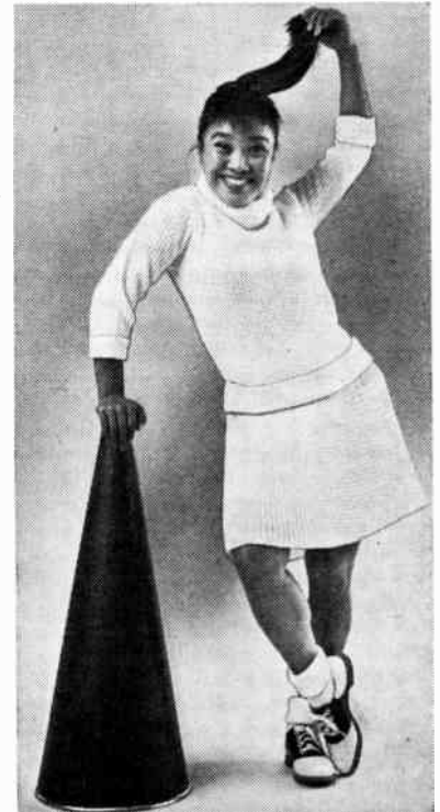
Broadway star Pat Suzuki is heard Monday on Broadway Holiday in a program of Richard Rodgers' music.