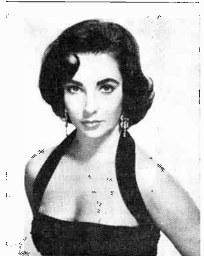
Elizabeth Taylor stars with Stewart Granger in Beau Brummell, Saturday on Great Movies.

With Stewart Granger, Elizabeth Taylor, Peter Ustinov and Robert Morley.