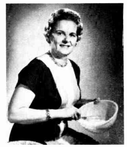
RECIPES FEATURED ON "LADIES FIRST" EACH THURSDAY