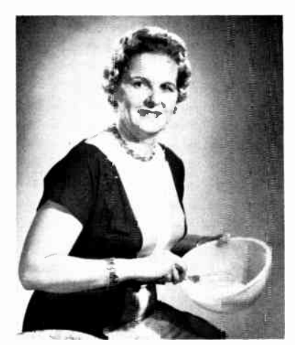
RECIPES FEATURED ON "LADIES FIRST" EACH THURSDAY