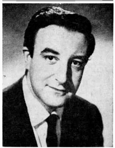
Peter Sellers stars in Saturday's presentation of Great Movies, Battle of the Sexes.

For the final judging, each of the seven CBC production centres (British Columbia, Prairie, Toronto Area, Ottawa Area, Quebec, Maritimes and Newfoundland) may select up to five films from programs originating in that area. Final judging will be done in one central CBC location. The competition is open to films telecast between January 1 and December 31. The Award will go to the film itself, and the trophy will be sent each year for display in the region in which the program originated. Individual awards will be given to the principal contributors to the award-winning film, which will, whenever possible, be given a special national showing on CBC-TV.