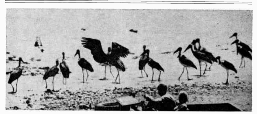
The Everglades of Florida are visited Friday on Web of Life, and close-np shots of the area's teeming animal life are seen.

This slight, intense little fellow is very big in the greasepaint world these days, "but," he says, "right now I feel as if I'm sitting on a keg of gunpowder. I've come (Please turn to page 29)