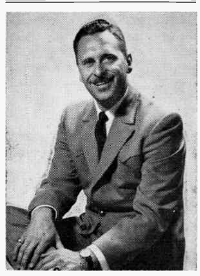
What's On Tapp?, featuring Gordie Tapp in a half-hour of music and comedy, returns to CBC Radio Thursdays at 1:15 p.m., effective this week.

position unchanged. The effect was more than an esprit arising from a sense of national pride. The men who made up its units were heartened by the comradeship that comes from shared experience in the face of difficulty and danger, whether the result be reverse or triumph. Their morale was high, and they endured grievous hardships and bitter setbacks with a dogged optimism and irrepressible cheerfulness. They were further strengthened by the confidence which they had in their leaders-a confidence that they would not suffer needless sacrifice through being committed in unsound tactics that had already been tested and found wanting . . .