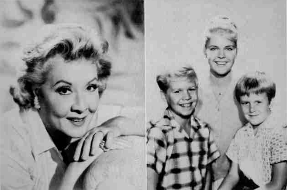
September 21 - 27