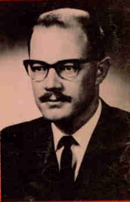
'Top of the Morning'