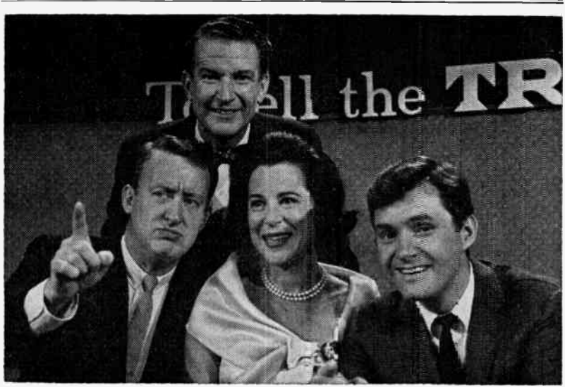
See if you can out-guess the panel on To Tell the Truth, weekdays at 3:00 p.m. on CBC tv.