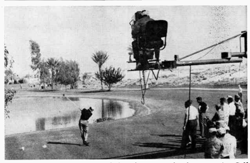
Top professional golfers compete before the cameras for the new series, Golf Classic, seen Saturdays at 3:00 p.m.