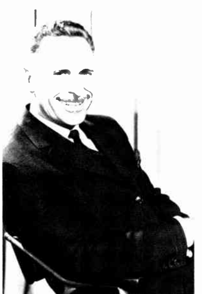
December 25th - 31st