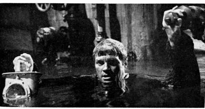
January 8th - 14th