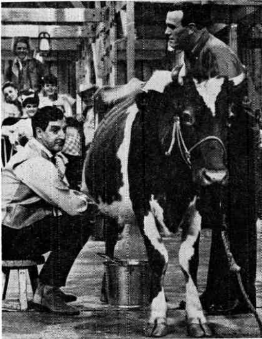
Danny Thomas and Eddie Arnold

Unaccustomed as he is to sagebrush and the wide open spaces, Thomas gallops through a special with Country and Western stars Sunday, March 13th, at 9:00 p.m.