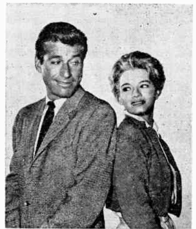
The CBC-TV Friday Night Movie at 9:00 p.m., stars Efrem Zimbalist Jr., and Angie Dickinson in The Fever in the Blood .