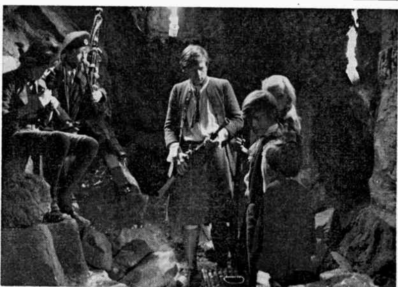
Summer Camp, Monday to Thursday at 5:00 p.m., presents this week a drama entitled the Young Jacobites, about two boys who find themselves suddenly in another era.

11:00 CBC-TV News 11:14 Final Edition 11:25 Five Star Theatre