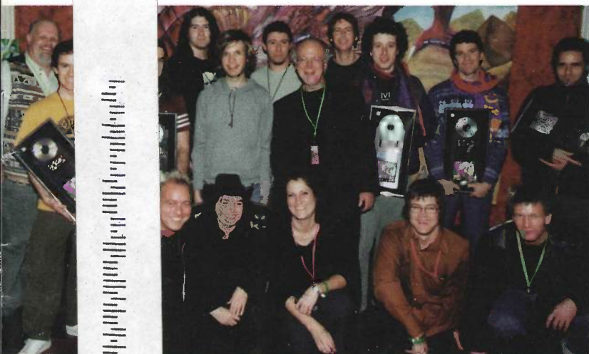
Following a surprise gig at the Phoenix in Toronto, Beck and his band were honored with platinum awards for his current album Midnite Vultures at Universal's national office staff.

Sanderson Taylor have the distinction of being the only law firm in Canada strictly specializing in Canadian music law.