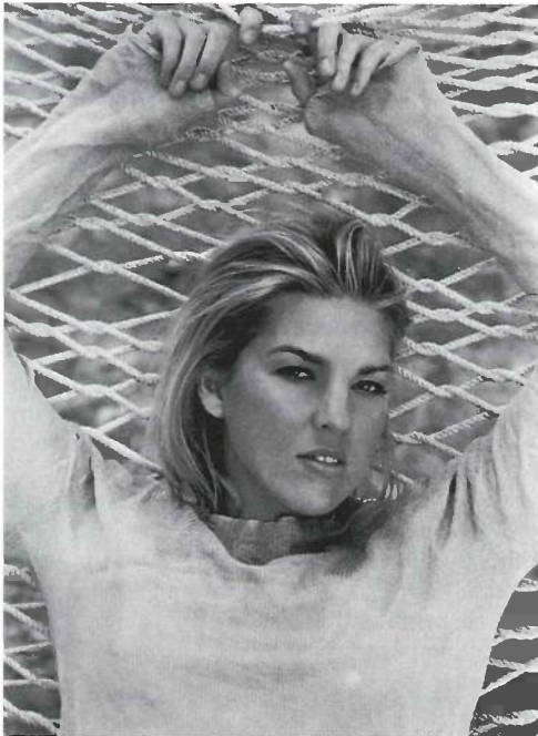
Verve artist Diana Krall

I NEED TO KNOW Marc Anthony MAMBO NO. 5 Lou Bega SOGNO Andrea Bocelli LIVIN' LA VIDA LOCA Ricky Martin BRAND NEW DAY Sting