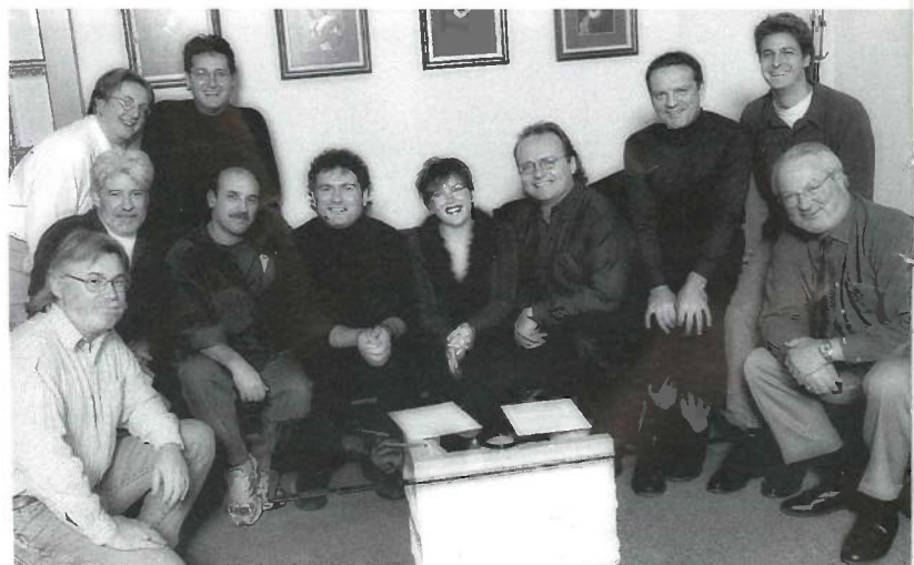
While in Toronto on tour to support their Christmas Album, The Barra MacNeils signed on the dotted line with the Oasis Entertainment senior management group. A new album from the group is due out this spring.