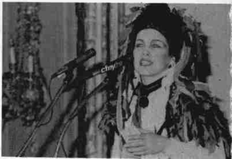
Lene Lovich, one of the favourite recording stars of CFNY-FM listeners, presented U-Know Best Album award to Rough Trade.