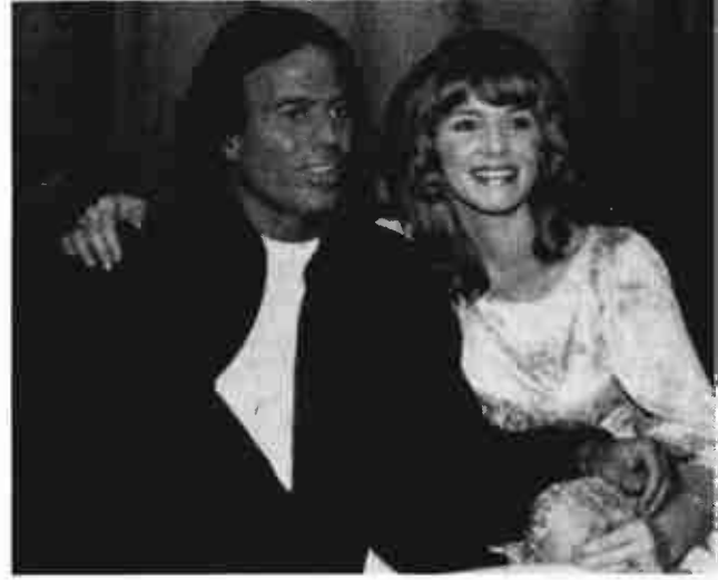
Julio Iglesias takes time out from his successful Toronto date to meet Juno Award winning (Instrumental Artist of the Year) Liona Boyd.