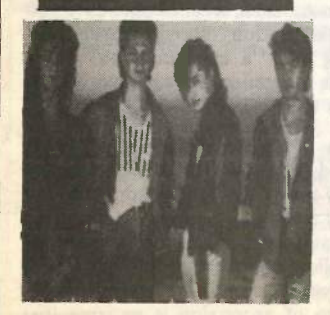
FUNKYTOWN Pseudo Echo RCA - 5217-7-R-N