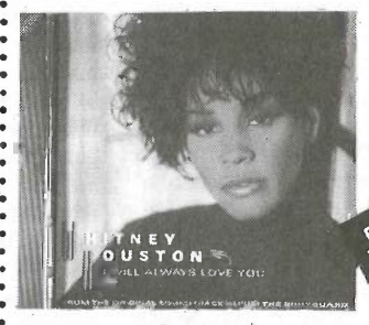
I WILL ALWAYS LOVE YOU Whitney Houston

Jack Grunsky's music takes children around the world to learn more about different