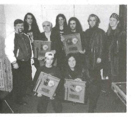
Ministry received gold awards for its AKA Psalm 69 album from Warner Music Canada staff while the group was in Toronto.

Tickets for the 7:30 event are $10 in advance and $15 at the door.