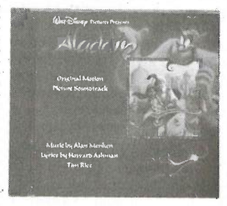
ALADDIN Soundtrack Walt Disney-60846-2