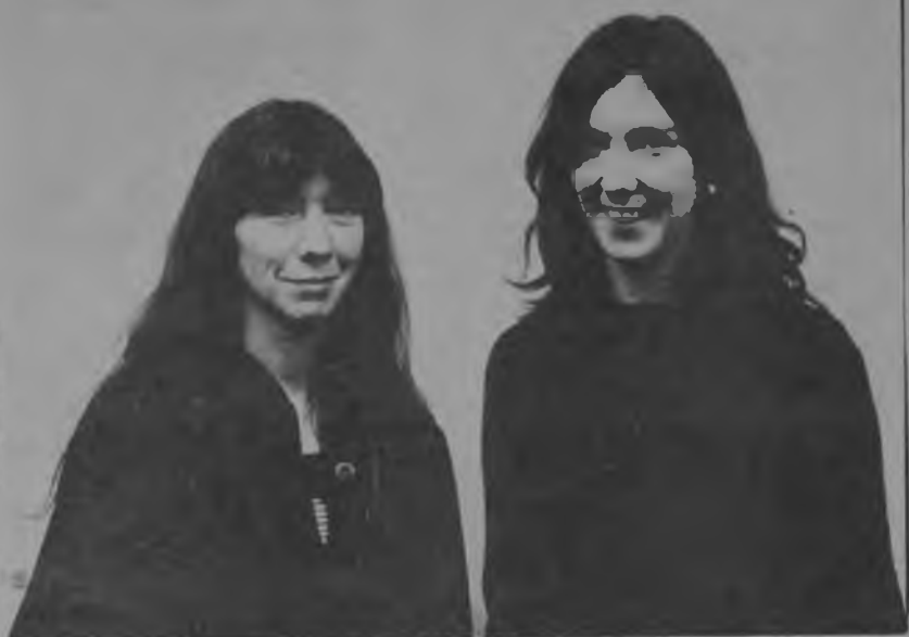
The McGarrigle Sisters