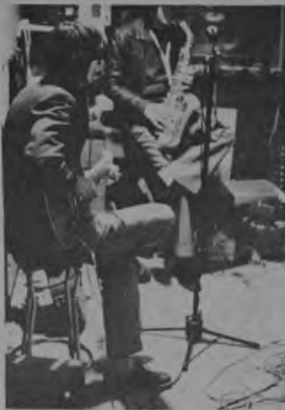
Split Enz at Harlequin Studios.