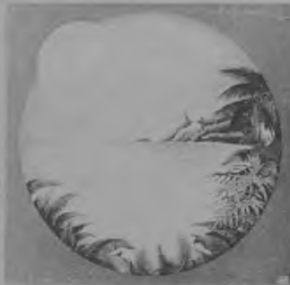
Luna Sea. Firefall. A new LP from the band that's set to take on the Eagles.

The Crusaders' chief asset is their sheer instrumental talent and wealth of experience. Their only drawback is a certain thinness of basic material and, perhaps, a tendency to play it safe — no-one is venturing anywhere near his edge on this record — but, as I've been saying, this music is aimed primarily at your feet, not your head. I play it all the time. Peter Thomson