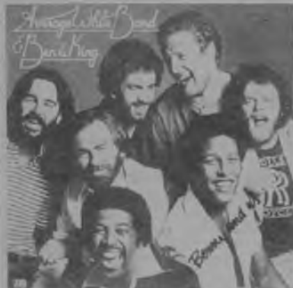
Benny & Us. Average White Band & Ben E. King. A legendary artist meets the current high-flyers.