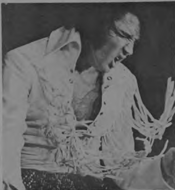
Elvis in That's The Way It Is , now showing at the Classic Cinema

At the time of writing Elvis has been dead a mere 24 hours. The news made front-page headlines in both Dailies, television plans and extravaganza and no doubt Time will do a special fea- ture, maybe even a cover. Why add to the media blitz? Simply because Elvis was not just a cultural phenomenon who made news; he was, and, despite the decline of his later years, he re- mained one of the few rock artists of genius. He was the spearhead of a movement that turned popular music inside out. Put bluntly, without Elvis this paper probably wouldn't exist.