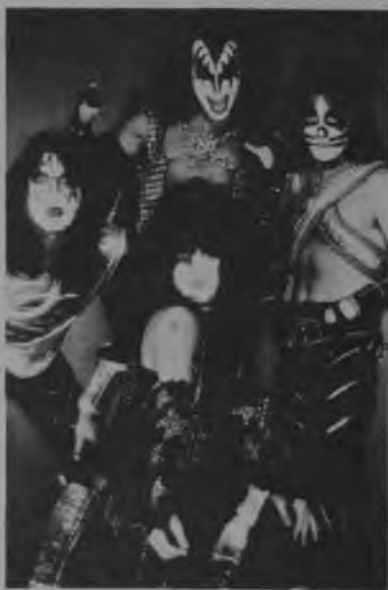
Kiss Love Gun Casablanca

On browsing through a selection of children's records at the Mangere kindergarten, I came across what appears to be the latest offering from a talented foursome of actors in the States going by the collective name Ssik. Based on the Warren comic strips, the record is an original rock opera that tells the story of four uglies from an underground garage that menace eardrums, entice eyeballs and make a lot of money.