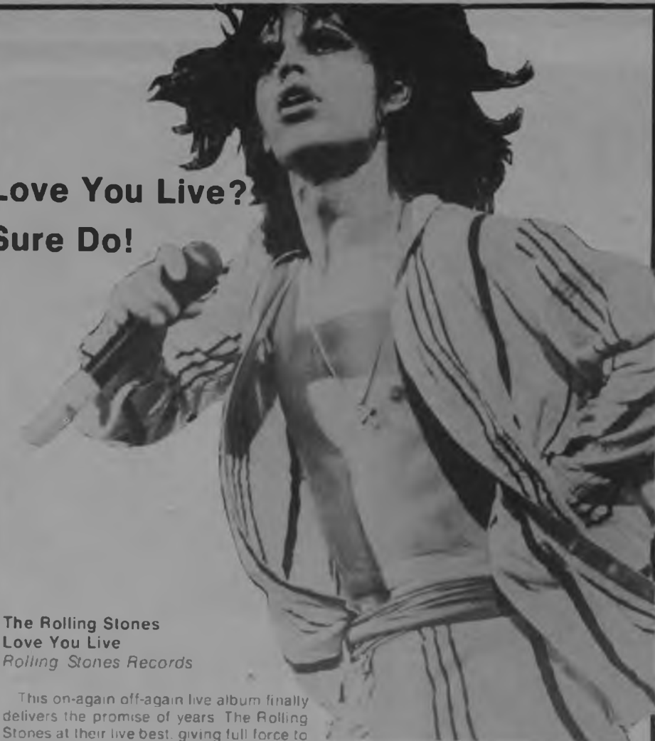
The Rolling Stones Love You Live Rolling Stones Records

This on-again off-again live album finally delivers the promise of years. The Rolling Stones at their live best, giving full force to that greatest rock and roll band in the world reputation.