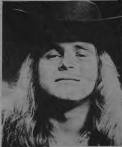
Ronnie Van Zant