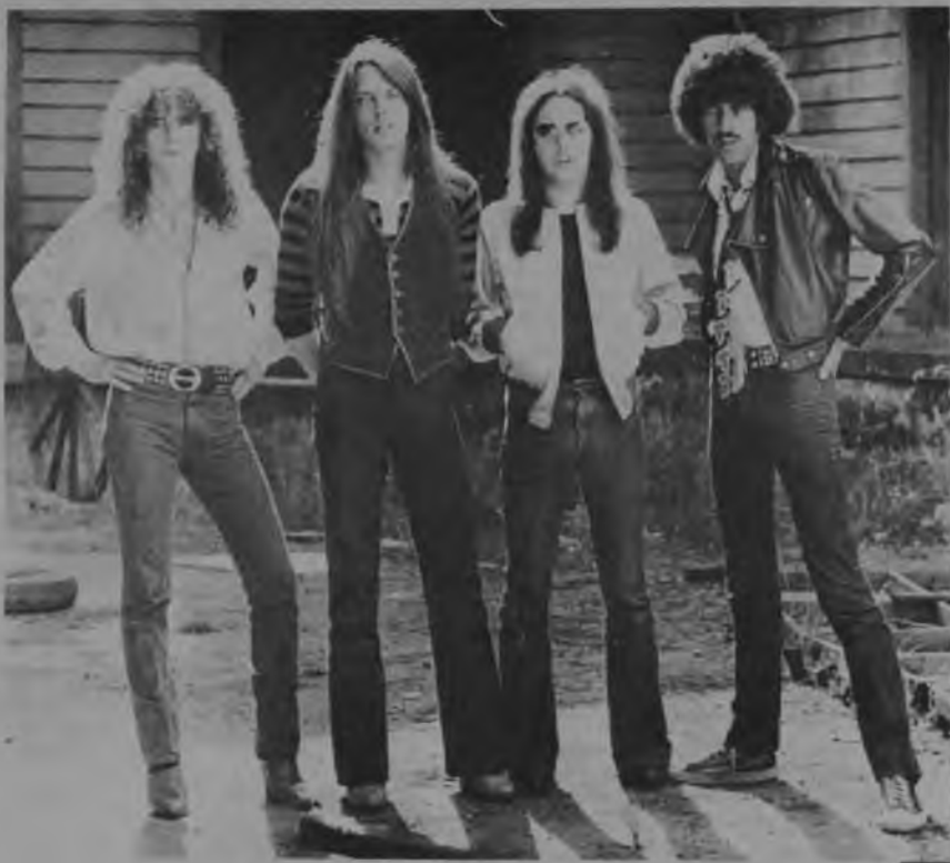
Brian Robertson, Scott Gorham, Brian Downey and Phil Lynott