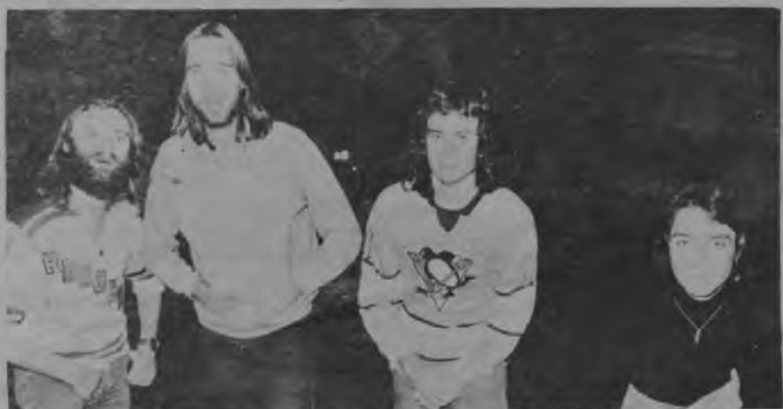
Genesis: Phil Collins, Mike Rutherford, Tony Banks and Steve Hackett