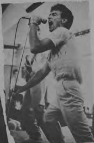
Sheerlux at the Windsor