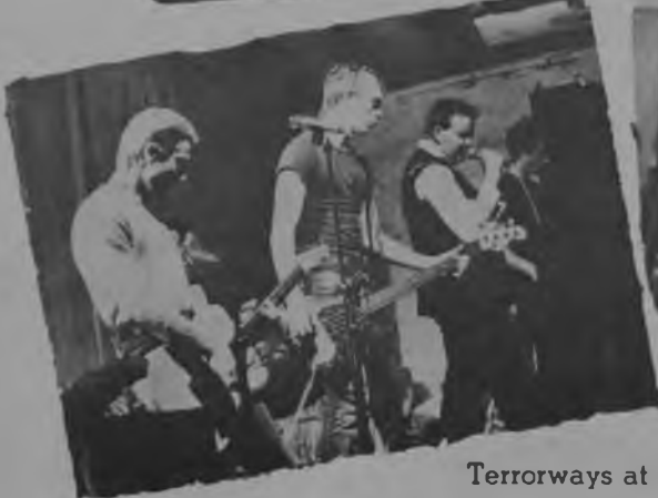
Terrorways at Zwines