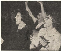
Above: Screaming fans... the ones lucky enough to get into the show.

"THE audience reaction has been terrific, we were really surprised... we had no idea we would go down so well. We're having a ball." This is the unanimous opinion of Bobby Vee, Tony Orlando and Clarence "Frogman" Henry who are being greeted with House Full notices wherever they go on their current tour of Britain. The three Americans have worked together before in the States, the extremely friendly atmosphere backstage is evidence of this.