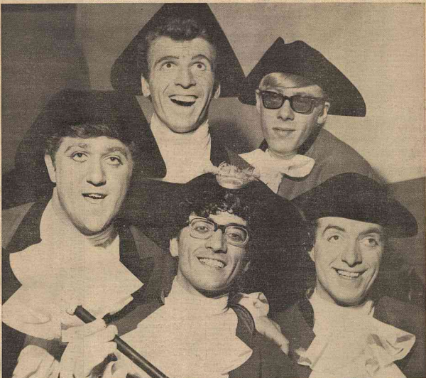
FREDDIE AND THE DREAMERS are officially Court Jesters in "Cinderella" at Chester, where they opened on Boxing Day, but that just means that they have licence to be their usual zany selves—and the audience love it!