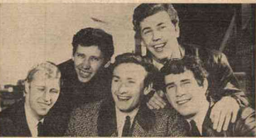
BRIAN POOLE and The Tremoloes . . . . . February