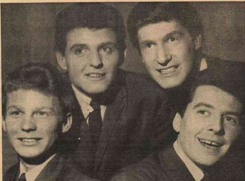
The Searchers are highly excited at their next single—"Noodles And Pins," a slow R and B number.

The sides reflect Mit's happy-go-lucky, free-blowing attitude outdoors on jazz and almost all the tracks are little gems. Sadly, as a