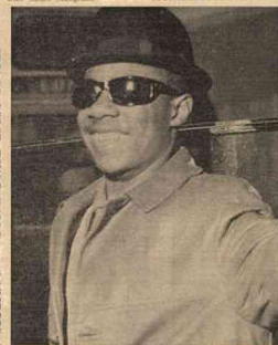
Thirteen-year-old child R and 8 singer LITTLE STEVIE WONDER flew into Britain from his Bowling, Dey for a show and, Steve, who has been appearing at the Paris Olympia, appeared on "Ready, Steady, Go" and recorded a "Lucky Star" single.

L ONNIE DONEGAN, who is starting recording his new ATV album "On The Downbeat" on January 18, will play Bermuda's Forty Thieves Club for an Easter season lasting two.