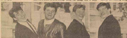
The SEARCHERS could have a big hit with the thoughtful "Needle And Fine."