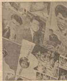
Gloria's bedroom wall is covered with pictures of Cliff—and she even has a full-length photograph of him on the ceiling.