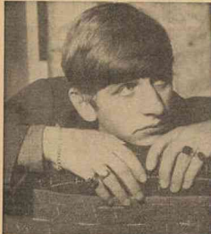
RINGO STARR—is he being neglected, asks a reader. See "Neglected Rings."