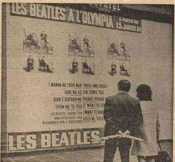
France is the first country to get a taste of "Les Beatles." As this poster in Paris shows, they were due to open at the Olympia last night (Wednesday).

No. 304 Week ending January 18, 1964 Every Thursday, price 6d.