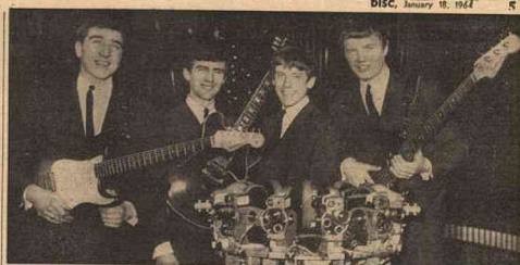
Swing music comes focused on THE SWINGING BLUE JEANS on Saturday when they filmed a spot in a Christmas picture, "Carolans Caravels," at the Empire Ballroom, Leicester Square. They played "Hippy" and they, like, did to be shown of the special Christmas theatre in London next month.

EVERY so often in the disc world, a record is released which, straight from the start, races up the charts. That was certainly the case with "Hippy Hippy Shake," the latest meteoric-rising single from The Swinging Blue Jeans.