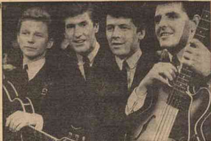
THE SEARCHERS—Liverpool duty had work was the real testing time for their new single.

THE SEARCHERS can relax. Their New Year resolutions to give the disc public a dose of rhythm and blues, Searchers style, has paid off.