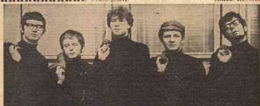
THE MANFRED MANN group have hit the Pop 30—but they look very cool about it. Left to right are Tom McGuinness, Mike Hugg, Paul Jones, Mike Vickers and Manfred Mann.