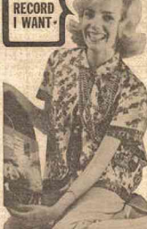
I CAN CHOOSE ANY RECORD I WANT.

BOOKS AND RECORD EQUIPMENT WITH SQUIRES 5% BUDGET