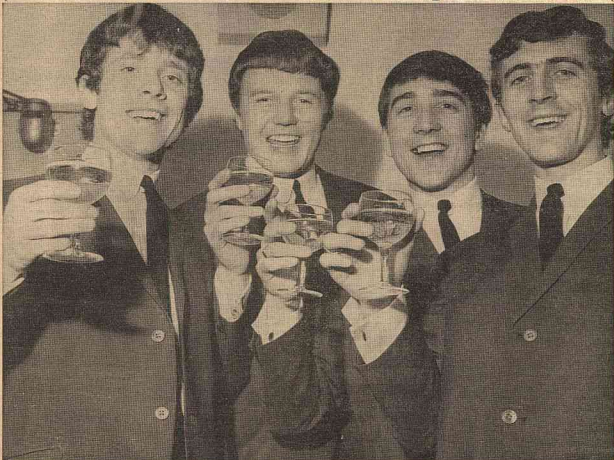
The Swinging Blue Jeans are toasting that Number One spot in the charts — and they've every reason to do so for "Hippy Hippy Shake" has made the top spot, ousting the Dave Clark Five! And they've done it in just five weeks, jumping from 25 to 10 to 3 to 2 and now to 1. No wonder that bottle of Champagne that DISC provided for them went down well!

"Please Please Me" album shoots to the top almost as soon as it is released. "She Loves You" a hit there as well. See centre pages.