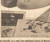
An literally a club, but unlimited choice of Records.