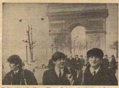
Walking down the Champs-Élysées. Background is the Arc de Triomphe.