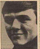
DAVE CLARK has crashed the Top 35 with his EP, and so have The Rolling Stones.

Compiled from dealers' returns from all over Britain.