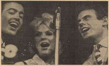
THE SPRINGFIELDS—top for the record from their Blue "All An Over Town."