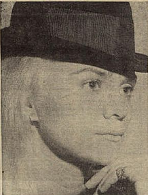
JACKIE DE SHANNON in a pensive mood.

This is the girl who penned THE SEARCHERS' latest smash—and . . . .