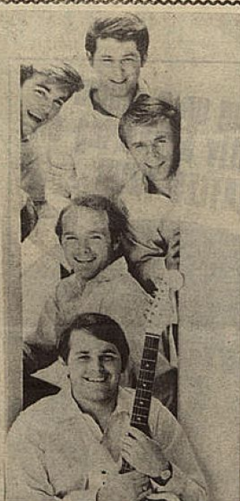
THE BEACH BOYS—they arrived in our charts on the crest of a surfing wave with "I Got Around."

... is to get eventually into the production end of recording. I enjoy performing, but I would like to investigate the business side of it, too.