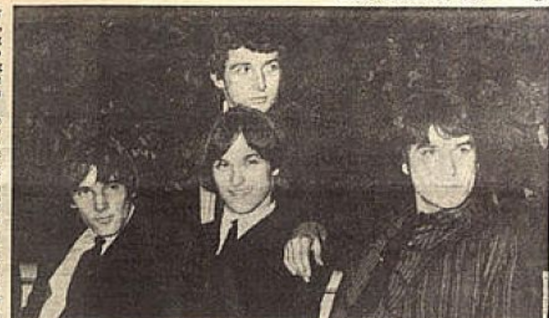
THE KINKS—life gets more and more hectic.

"We hope it's going to be ready soon," Mick told me. "At the moment we're having to travel in a small car and while