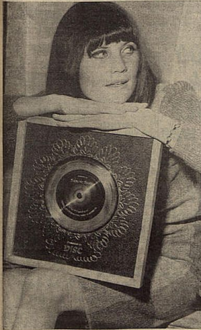
SANDIE proudly displays her Silver Disc.

SEVENTEEN-YEAR-OLD Sandie Shaw from Dagenham, Essex, hits the Number One throne of honour in DISC's Top Thirty this week with "Always Something There to Remind Me," her second record.