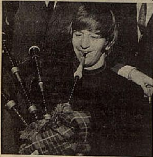
Deserted his drums?