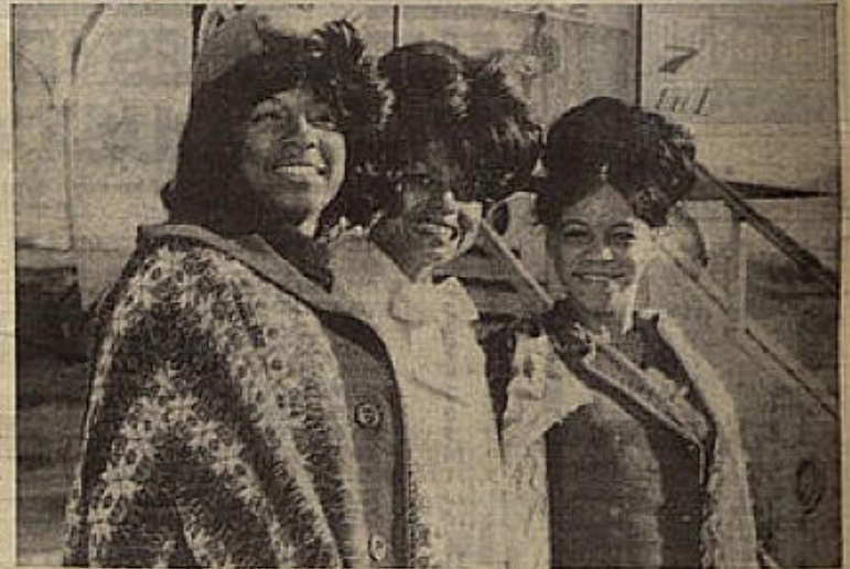
THE SUPREMES—to head the fantastic Tamla-Motown package.

Britain in 1965 will undoubtedly leave us completely shattered. It is a musical attack on the senses. It will certainly be nearly impossible for a British package to even try and generate the same sort of explosive excitement afterwards.