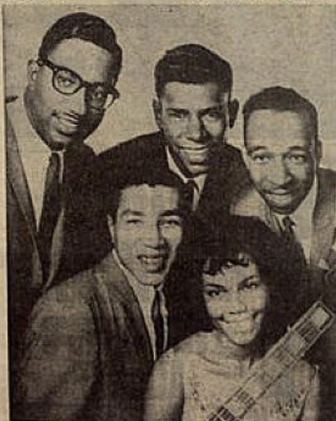
THE MIRACLES—here before Christmas.

marks like "It's So Good" and repeat it again and again. Then they give out with lots of "Come on's." They do it all frantically and you can say these things as well if you want to. In fact on A Tamla-Motown package you, the audience, can say anything you feel like—within reason!