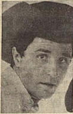
PEPPI—tipped for the top.

PEPPI is tipped for the top by DUSTY SPRINGFIELD