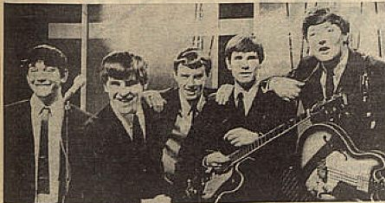
THE ANIMALS—a great "Bo Diddley" work out