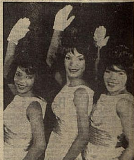
MARTHA AND THE VANDELLAS—make lovely, frantic noises.

"Now," he will say in the middle of all the riot, "I want all the girls to sing 'OW!' And I want all the boys to sing 'Oh yeah, yeah, yeah.'" And we will. All the Tamla artists encourage audience reaction. They make funny little singing re-