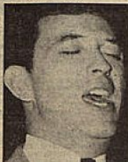
MARK MURPHY—stylish versions of quality songs