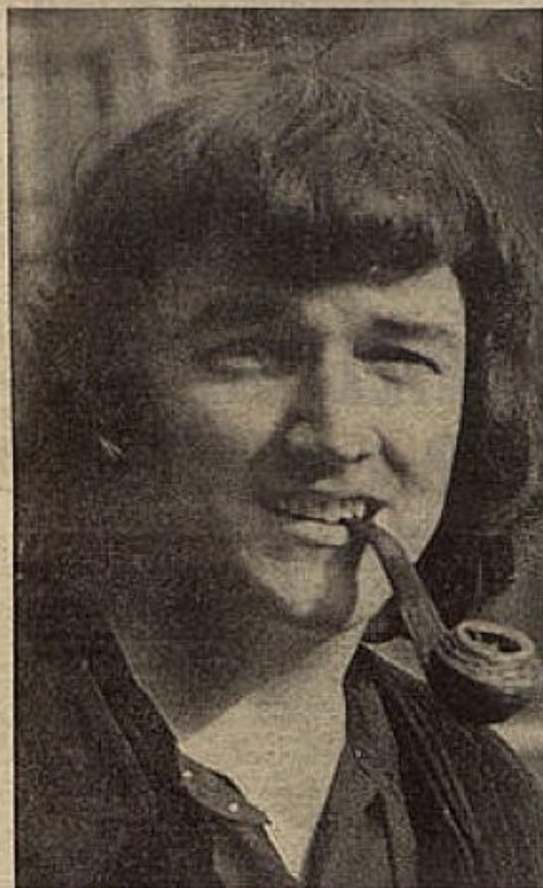
PROBY—hair nearly long enough now.