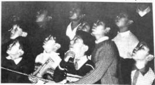
Pop fans from all over the world love the Four Pennies.