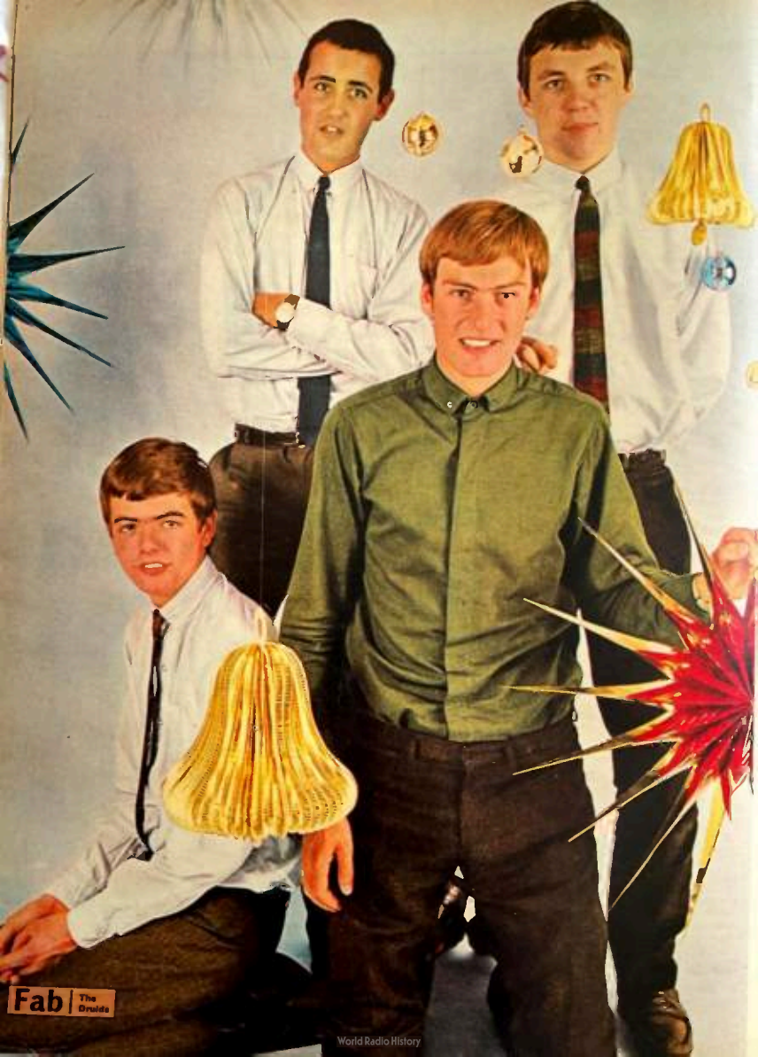
Fab The Grads