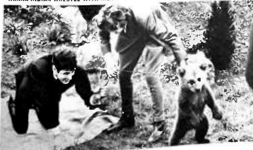
"PARTY'S OVER—FEEDING TIME."