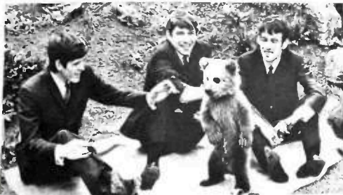
"WANNA INDIAN WRESTLE WITH ME?"