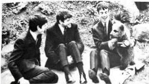
"MY MA'S A BIG FAN OF YOURS."