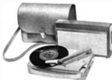
Philips Disc Jockey Battery Portable Record Player Model AG-4000 Only 17½ gms. Carrying case extra

Everywhere but everywhere the gang goes, my Disc Jockey comes too—plays anywhere, any time, any size record—perfect for pops or LP. So we're sure of a swinging time wherever we are and whatever sort of music we need.