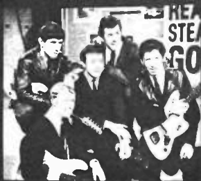
Brian Poole and The Tremeloes

Brian Poole and The Tremeloes must be unique in the pop world as they've only missed having one Christmas at home. They love spending that one day round the fire with their relatives.