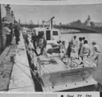
Good TV Ship Southerner on the Seine with the winged horses of the Pont Alexandre III in the background, Man in the tablecloth-check shirt is Mike Mansfield —talking Unit Four Plus Two.