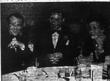
This happy what was taken between the sessions of the Joe Loss Band at the Grosvenor House. First Bill held last week in aid of the Royal Police Corps Association, and then with star John Mills and his play...