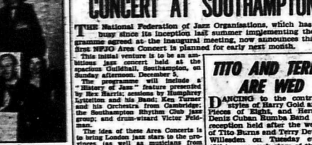
THE National Federation of Jazz Organisations, which has been busy since its inception last summer implementing the programme agreed at the inaugural meeting, now announces that the first NFJO Area Concert is planned for early next month.