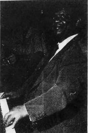
Meade Lux Lewis, possibly the greatest boogie pianist, will have some of his classic tracks out here shortly.