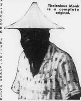
Thelonious Monk is a complete original.

At strategic moments in Charlie Rouse's tenor chorus, he would select a chord formation on the keyboard with deep deliberation and prod it viciously, withdrawing his elbows in an odd flapping movement like some huge, ungainly crow trying to take off from the piano stool.