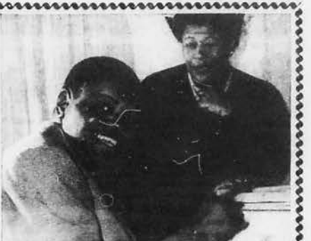
Ella Fitzgerald and Oscar Peterson had to cancel some of their concerts owing to lack of support.

Reserve at: Filming, Margate—Oxford Street, Granada TV Manchester, Newcastle—New Chapel, Birmingham.