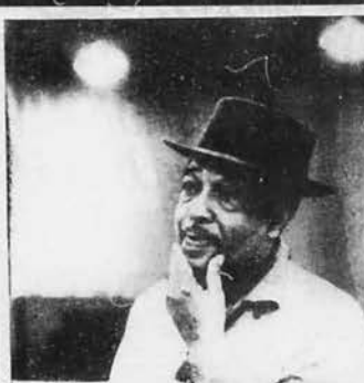
Duke's score for "Anatomy of a Murder" contains much pure jazz.

PHILIPS RECORDS LTD., STANHOPE HOUSE, STANHOPE PLACE, LONDON, W.2