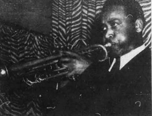
On his latest releases, "The Swinger" and "The Original Harry Edison"—the trumpeter produces two contrasting styles.