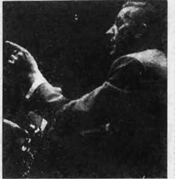
Stan Kenton—remember the pilgrimages to Ireland?

folk singers could be invited, and they, together with our own British singers, could make such a festival a great success.—English, Ipswich.