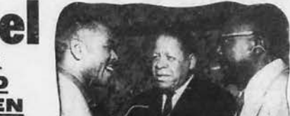
Red Allen (centre) meets Brownie McGhee (l) and Sonny Terry at the Jazzshow's Jazz Club, London

BROWNIE MCGHEE, who left London on Tuesday at the end of the record British tour, gave an encouraging start to the Jazzshow's Jazz Club's new big policy.