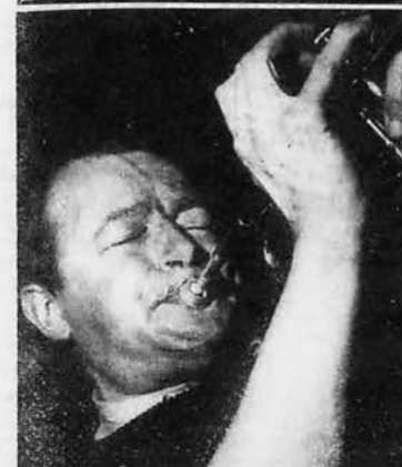
Did Humph—and that trumpet—blow the wrong way?