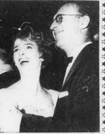
Millicent Martin and Norrie Paramor take the floor for a quickstep.

Four new girls in Ivy Benson Band Immediately after the conclusion of her fifth consecutive tour, Douglas (H.M.) Corporation Ivy Benson has been joined for good at the Villa Marina.