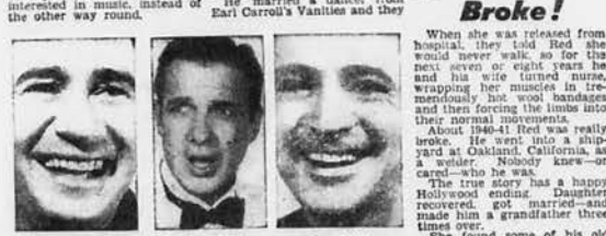
• Shelly Manne • Bob Crosby • Ray Anthony