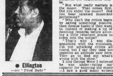
Ellington — see "Tired Duke"