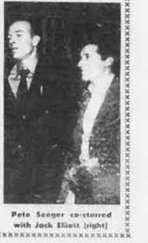
Pete Seeger co-starred with Jack Elliott (right)

In this juncture of conversation, there's a nuance of temperance. He's a nuance of temperance.