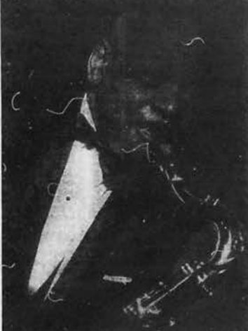
Coleman Hawkins—a consistent poll-topper