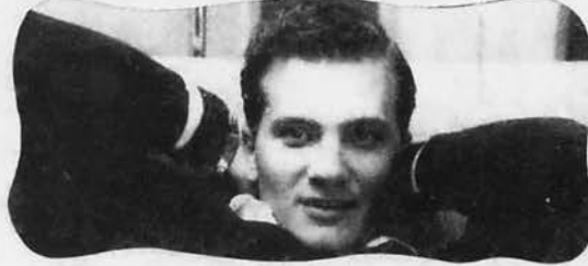
Pat Boone hopes his new disc—out today—will make the Top Ten.