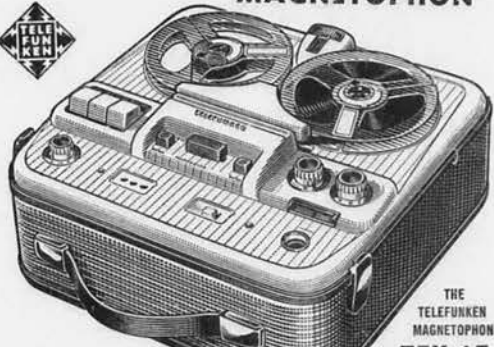
THE TELEFUNKEN MAGNETOPHON 75K-15 in Styron case 52 GNS. (including microphone)