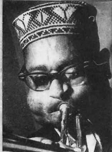
Dizzy Gillespie has again blown his top. A fortnight ago he complained about the curtains closing on him at the opening of the "Newport Jazz Festival" tour. Now he has had a sampling match with a Bristol audience. See page 11.