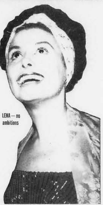
LENA - no ambitions

Prospects... "I think films are going to be great for the Negro people in the future, because of the gradual prospect of our race economically, politically, and culturally, and through our Supreme Court decision about equal education."