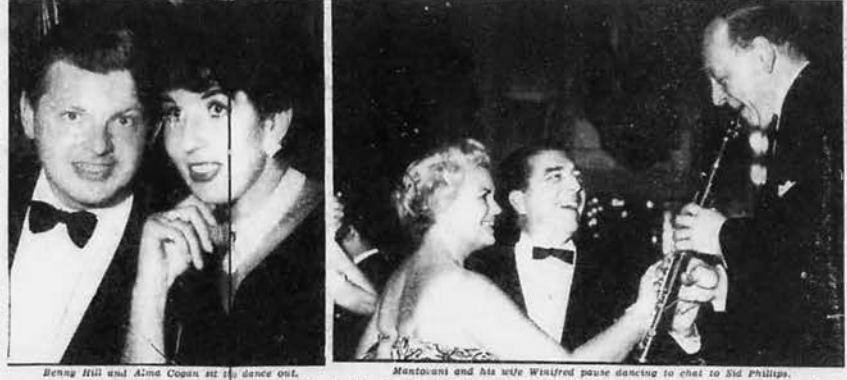
Benny Hill and Alma Cogan at the dance out.