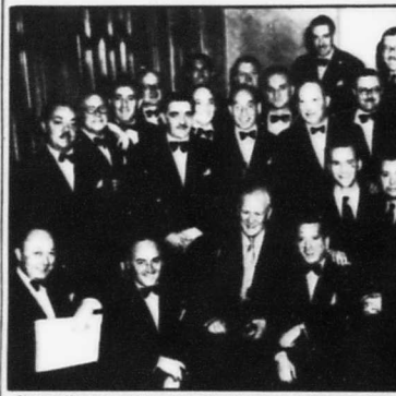
Six bandleaders, one musical comedy star, a celebrated clown, a famous disc-jockey, a variety bill-topper and two rock notabilities are among the "old boys" in this picture.