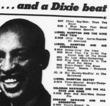
... and a Dixie beat

THE current Dixieland craze in America has resulted in so many scrawny back-up ensembles of the old Dixieland school that the resultant music has been becoming phoner.