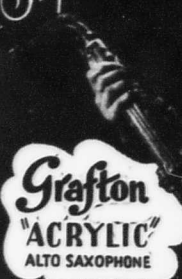
Portrait of famous Band Leader and H.M. Musician of the year JOHNNY DANKWORTH