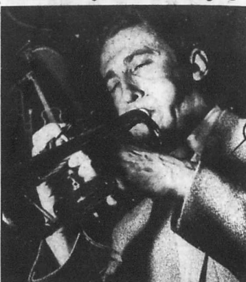
Trumpet star Lou Condon takes his first solo as a member of the Kinsey 5.

THE coming of the long-playing record knocked the shackles of jazz and pop music. Suddenly—gone were the limitations of the three-minute 78 rpm disc; a new freedom had come to recording artists.