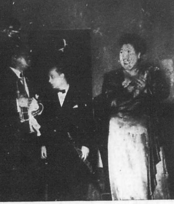
Jack Teagarden with Louis Armstrong, Barney Bigard and Volma Middleton.