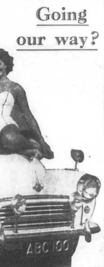
Pearl Bailey SINGS

After each number she removed first one dress then another, finally appearing in gleaming tights which showed off her figure to perfection.