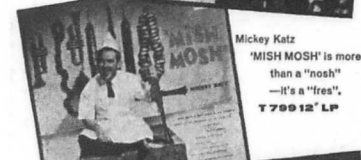
Mickey Katz "M'ISH MOSH" is more than a "nosh"—it's a "fres", T799 12" LP