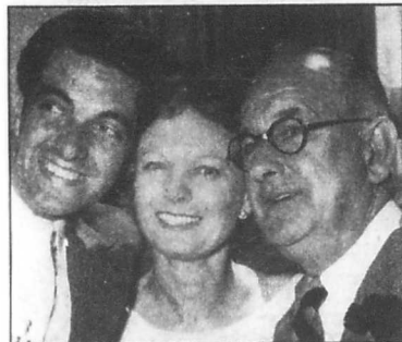
The Frankie Vaughan film "These Dangerous Years" had its world premiere on Monday. This shot sets takes at the Press preview last week in Liverpool—Frankie's home-town. With Frankie are producers Herbert Wilcox and Anna Neagle.