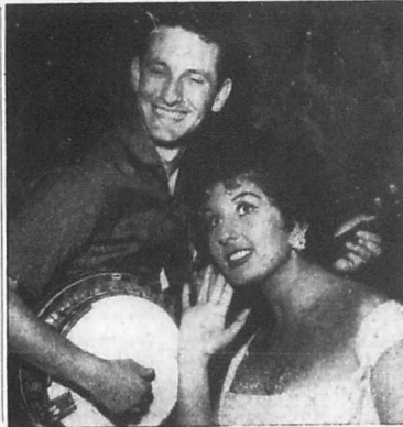
Skiffle king Lonnie Donegan tries it's style on Alma Cogan. And Alma seems to approve of the style that has put him at the top of the bill at three West End theatres. This shot was taken at the London Hippodrome, where they opened on Monday for a four-week season. (See review on page 11.)