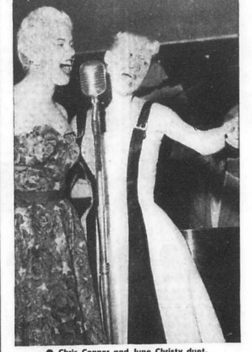
Chris Connor and June Christy duet.

Capitol Artistes...Capital Entertainment Electric & Musical Industries Ltd., Record Division, 8-11 Great Castle St., London, W.1