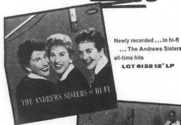
Newly recorded... In hi-fi... The Andrews Sisters all-time hits LCT 6132 12" LP