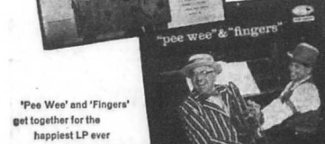
"Pee Wee" and "Fingers" get together for the happiest LP ever T793 12" LP