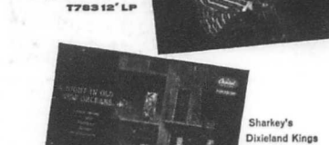
Sharkey's Dixieland Kings Actually recorded on Royal Street in New Orleans—a cert for 'trads', T792 12" LP