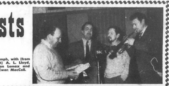
Humphrey Lyttelton, with (from left) A. L. Lloyd, Alan Lomax and Ewan MacColl.

SO the promoters think the up-and-coming bands are too good and are ruining the jazz bit set-up.