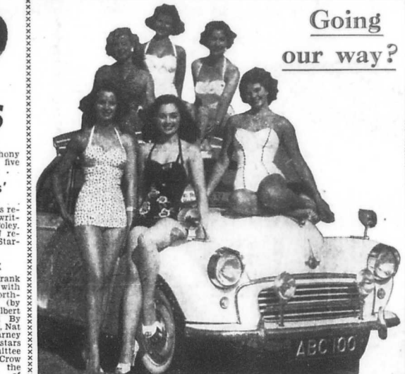
The strains of Joe Loss and his Orchestra, these six girls paraded last Saturday in Southport for the local rounds of the TV Bathing Beauty Queen of Great Britain Contest...