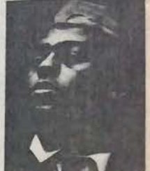
SHEPP: Chaotic travesty

As usual, there was an afternoon jazz workshop ses-