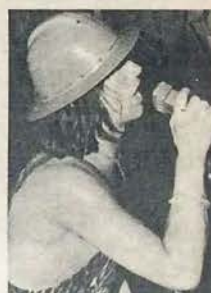
The place: Viareggio, Italy. The scene is a new club for teenagers. The artist in leopard skin and his hat is our own Lord Sutch taking time off from Parliamentary campaigns to earn a bit of bread.