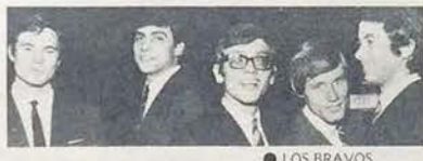
• LOS BRAVOS

cerned. In Spain they scream at us because we have two records in the Top 10 and they know our names — not because they like what we are playing at that time."