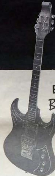
Cat. No. 560 90 gns.