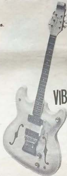
Cat. No. 548 126 gns.