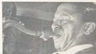
● ILLINOIS JACQUET