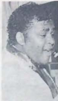
SOLOMON: opens Friday