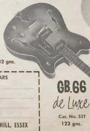
GB.66 de Luxe