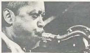
● SONNY STITT