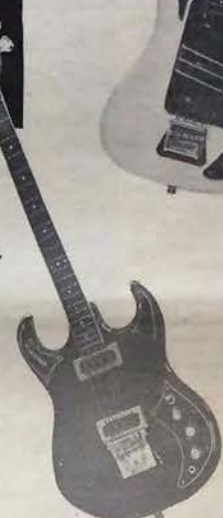
Cat. No. 561 100 gns.