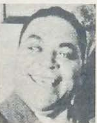
FATS: amiable biography