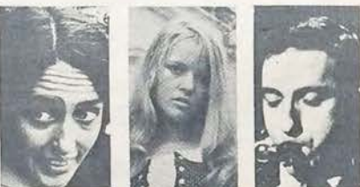
BAEZ: rock 'n' roll DANA: Grand Prix BOBBY: Chickster

nearest thing to rock-'n'-roll we shall hear from Joan."