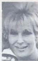
DUSTY: tops bill

DUSTY SPRINGFIELD and the Lovin' Spoonful are to tour Britain for two weeks at the end of September.