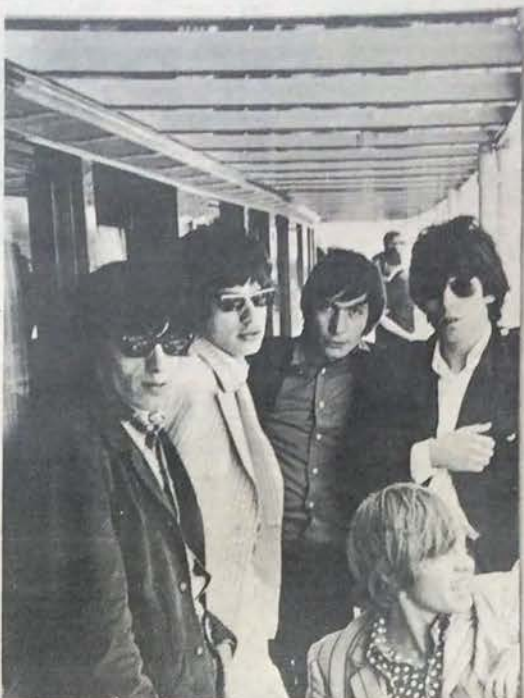
STONES seen aboard Allen Klein's yacht when they arrived in New York for the start of their fifth American tour.

Meanwhile, over 9,000 fans rioted during Herman's concert at the Bear Stadium, Denver. A hundred fans rushed the stage with half the audience following them.