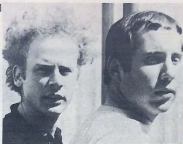
SIMON and GARFUNKEL: social and musical communication

This was more than just a hit parade act appearing before a club audience, but a true communication between two highly emotional singers and a highly receptive gathering of young people. They communicated in both the social and the musical