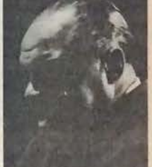
BASIE: speedboat swing