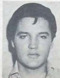
ELVIS: new cut