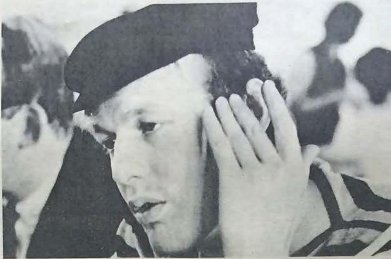
BOBBY ELLIOTT: his superb drumming spurs the Hollies on.