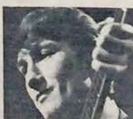
CRISPAN: all-star disc