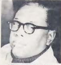
ROY: long engagement

NEW YORK ROY ELDRIDGE has joined the Count Basie band. The trumpeter recently completed a long, successful engagement at New York's Embers West. He was a vital figure in such big bands as McKinney's Cotton Pickers, Fletcher and Horace Henderson, Teddy Hill, Gene Krupa and Artie Shaw.