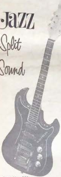
Cat. No. 503 102 gns.