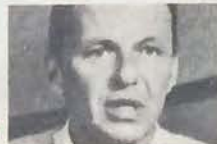
FRANK: no session fixed