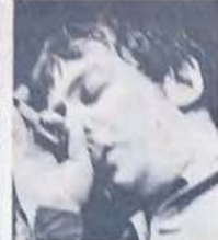
ERIC: not involved

The ALEX WELSH BAND play the Hermitage Ballroom, Hitchin (9 pm).