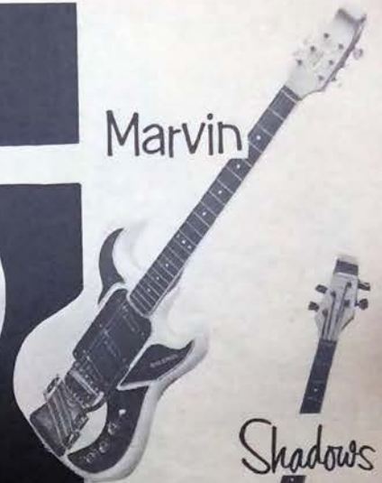
Cat. No. 524 149 gns.