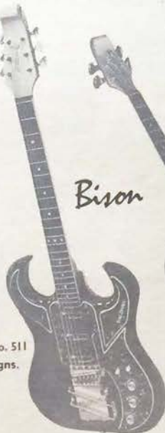
Cat. No. 511 140 gns.