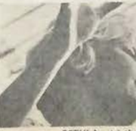
PETULA: strictly for the French