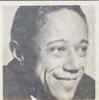
SILVER: at Ronnie's

H ORACE SILVER, American bandleader, pianist and composer, will make his first British appearance when he brings his quintet to Ronnie Scott's club in September.