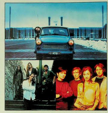
1/2 take the motoring award (top): Extreme find new friends (bottom left) as do My Bloody Valentine

Principal, School for the Performing Arts