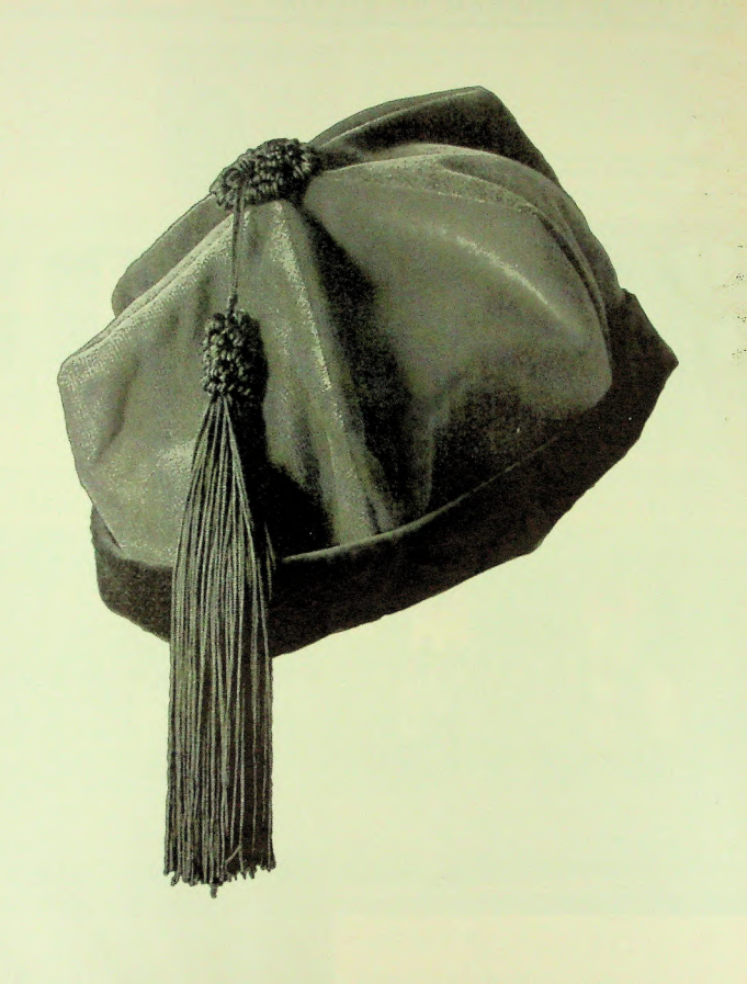
Hats off to Obie