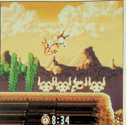
Busby: the bounding bobcat is set for

Accolade has also signed up promotions with The Sun and Channel Four's The Big Breakfast, which will break on the week of release. If you need more, there's a Capital Radio Bubsy Weekend and a touring roadshow plus POS available. IFFEE