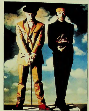
Pressure Drop: eclectic debut album finally gets UK release

Guaranteed banker Should do well Worth a punt Only for the brave SOR only