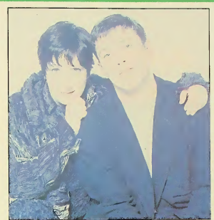
The Other Two: bright, bubbly and accessible

Guaranteed banker Should do well Worth a punt Only for the brave SOR only