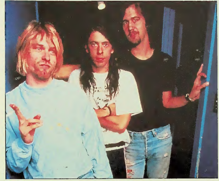
Nirvana: another track lifted from the In Utero album, and another hit

topped the UK paperback charts for months. A