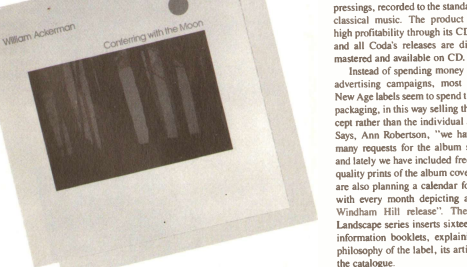
William Ackermann- co-founder of the Windham Hill label in 1976, made the alhum "Conferring with the Moon"

Not only the distribution outlets differ, but also the marketing strategies are completely different from those applied to the youth market. According to Bert de Ruiter, product manager for A&M, to reach the yupnie market one has to come up with completely different methods compared to the traditional pop marketing. "The yuppie market demands high quality products: products with a timeless quality and a real duration not dependent on hit singles which normally have a six-week shelf life".