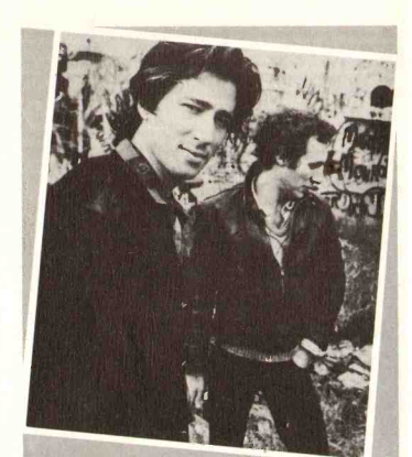
David & David

Another important first for A&M is an exciting premiere shared by Music & Media. The CD sampler is included free in this issue for 600 selected key media people on the continent of Europe! This is inserted complete with jewel box packaging and liner notes.