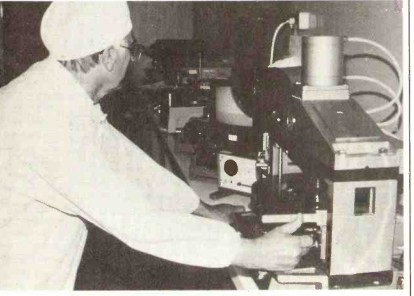
Personal attention is part of the process at Dureco